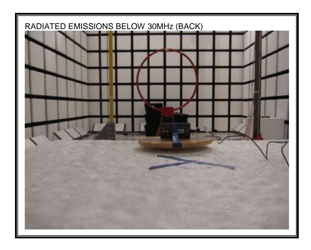
Page 22 of 25