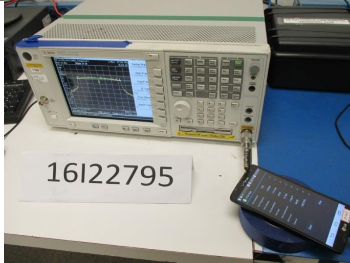
ANTENNA PORT CONDUCTED PHOTO