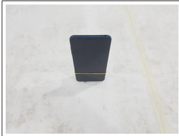
EUT Position: Z-axis