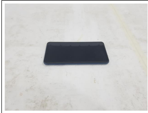
EUT Position: Y-axis