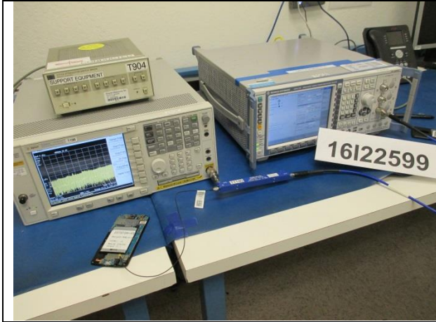
ANTENNA PORT CONDUCTED PHOTO