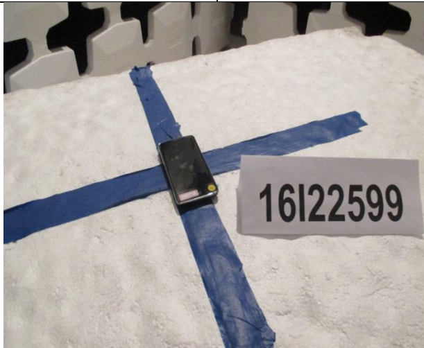
X-AXIS FRONT PHOTO