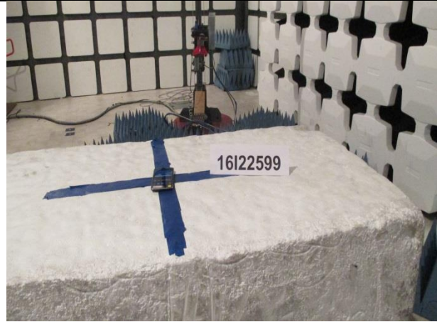
Above 1GHz PHOTO