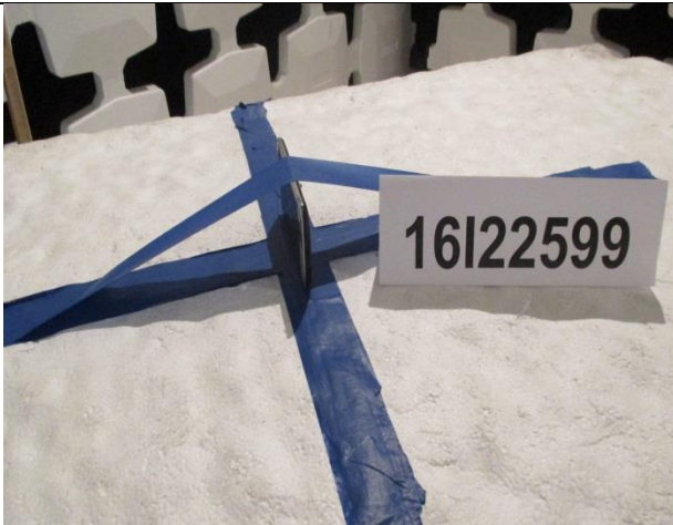
Y-AXIS FRONT PHOTO