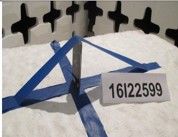
Z-AXIS FRONT PHOTO