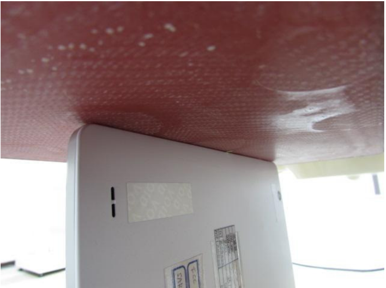
[Distance of 0 cm from the EUT]