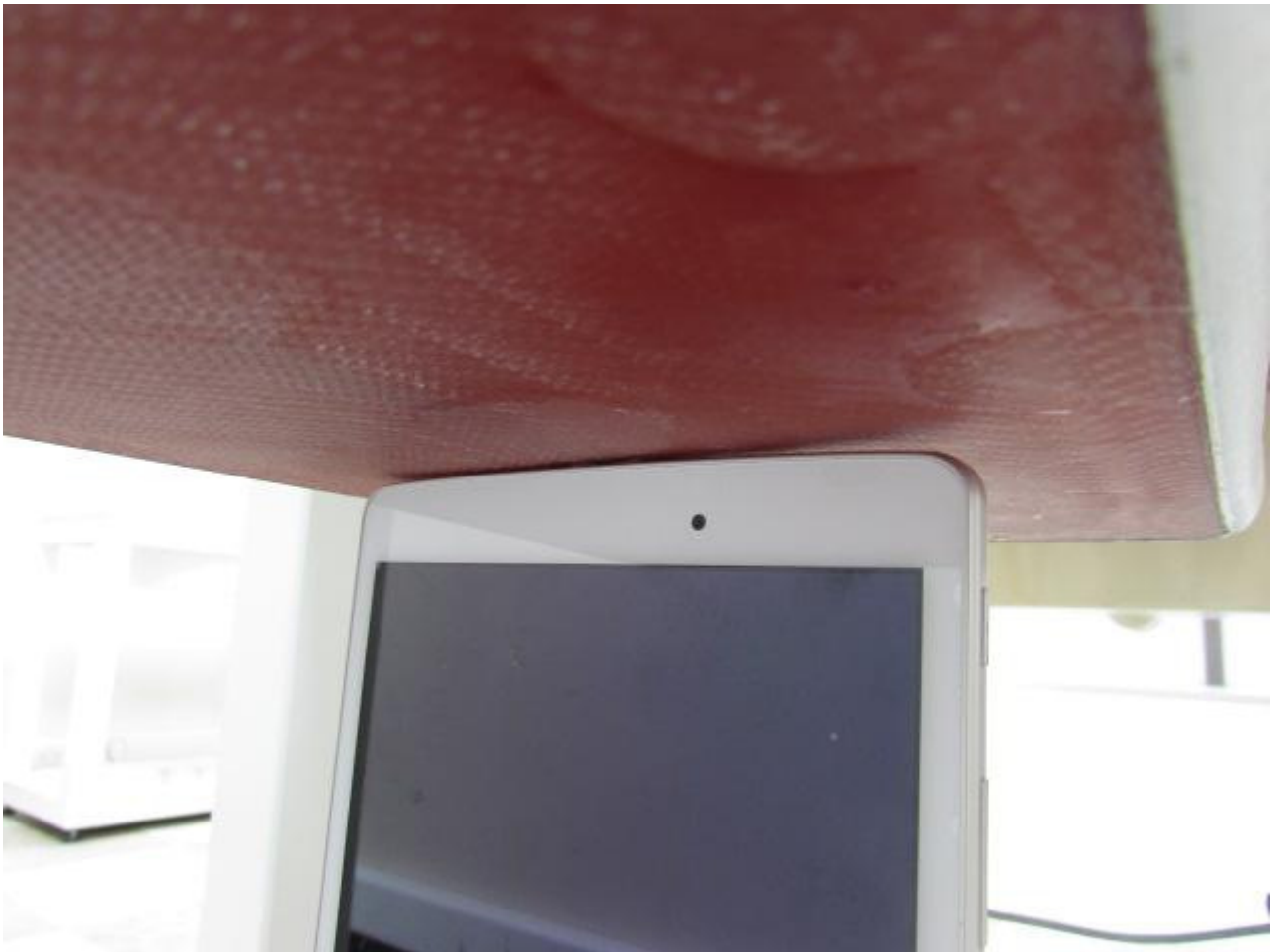
[Distance of 0 cm from the EUT]