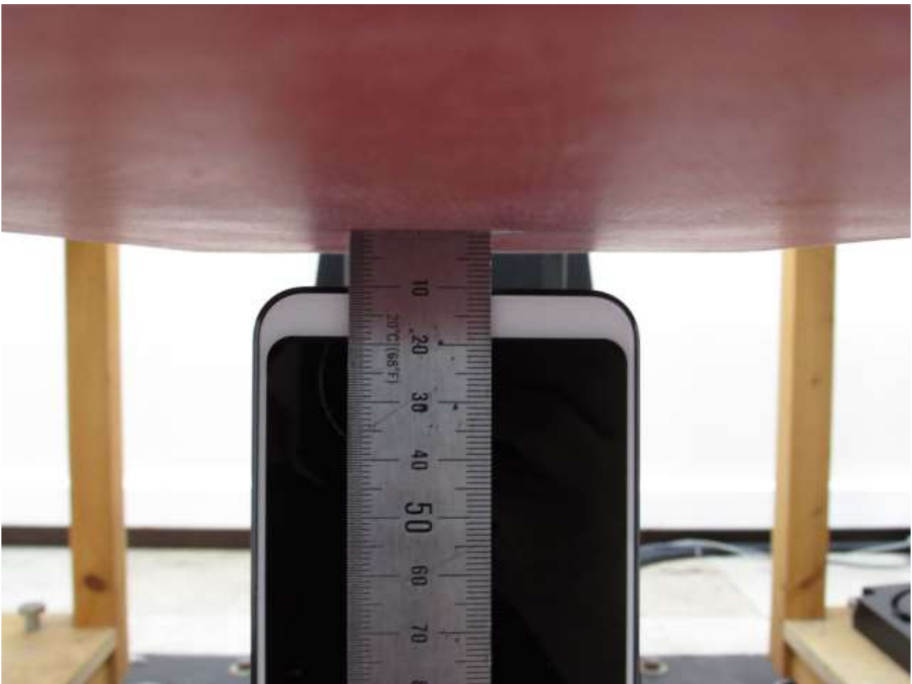
[Distance of 1.0 cm from the EUT]