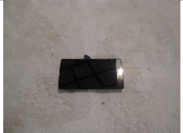
X-AXIS FRONT PHOTO