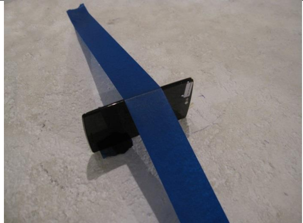
Y-AXIS FRONT PHOTO