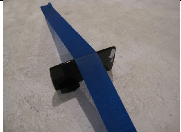
Y-AXIS FRONT PHOTO