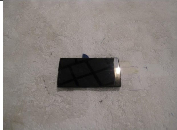
X-AXIS FRONT PHOTO