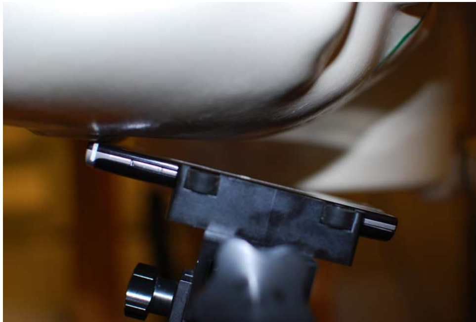
SAR Test Setup Photo 2 – Right Tilt