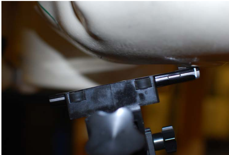
SAR Test Setup Photo 4 – Left Tilt