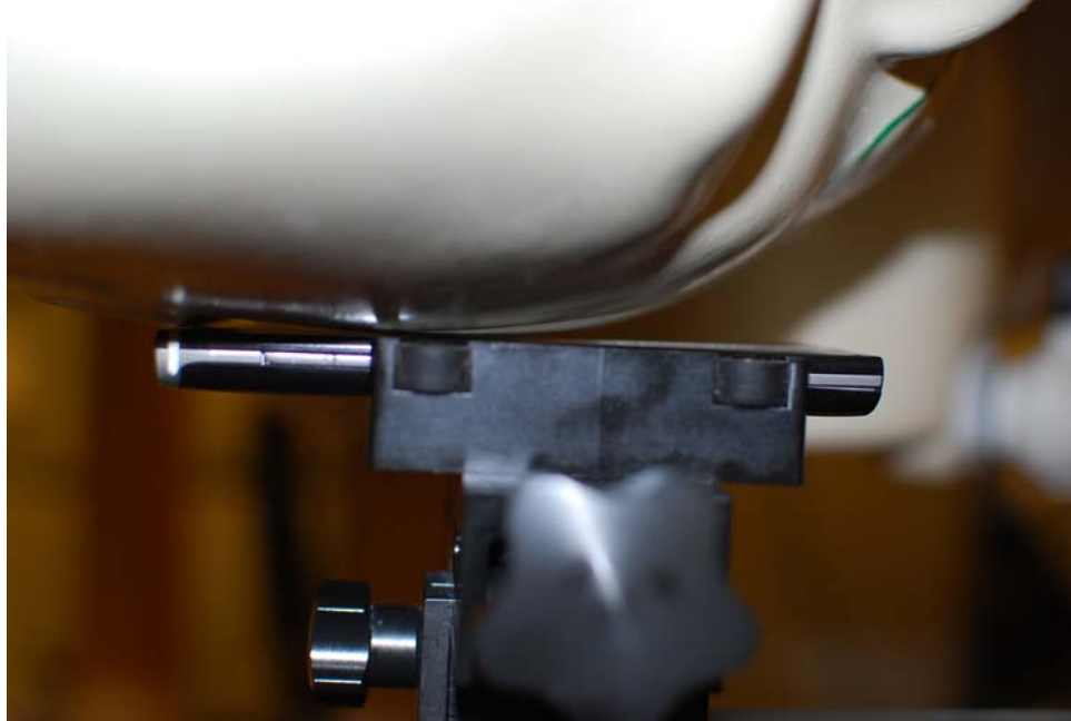
SAR Test Setup Photo 1 – Right Touch