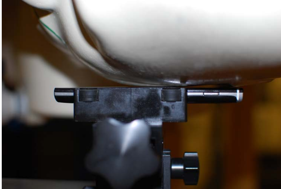
SAR Test Setup Photo 3 – Left Touch