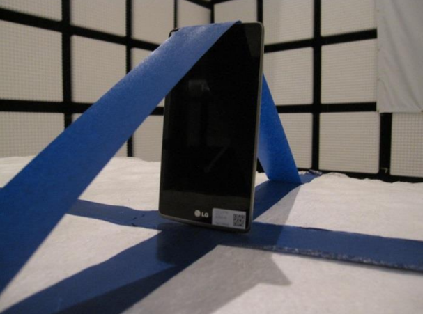
Z-AXIS FRONT PHOTO