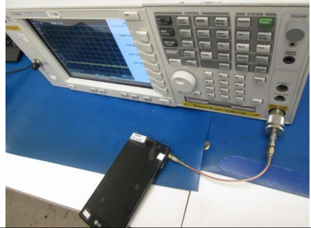
ANTENNA PORT CONDUCTED PHOTO