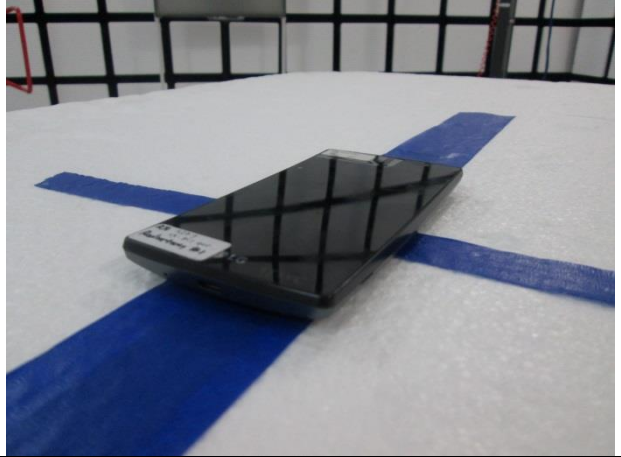
X-AXIS FRONT PHOTO