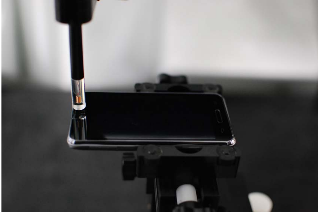
Figure 13-1 Test Setup for Wireless Device