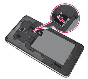
NOTE The LG870 supports memory cards up to 32GB.

Insert the memory card into the slot. Make sure the gold contact area is facing downwards.