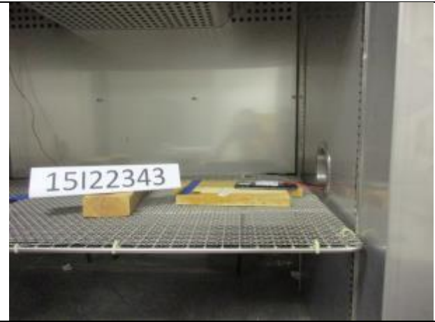
ANTENNA PORT CONDUCTED PHOTO