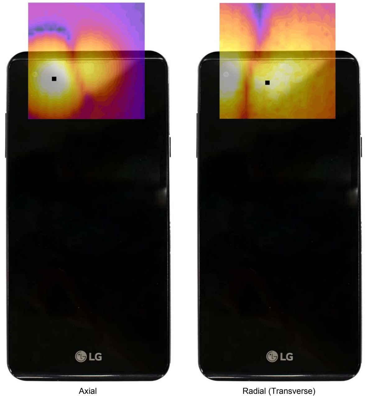
Figure 13-3 T-Coil Scan Overlay Magnetic Field Distributions

Note: Final measurement locations are indicated by a cursor on the contour plots.