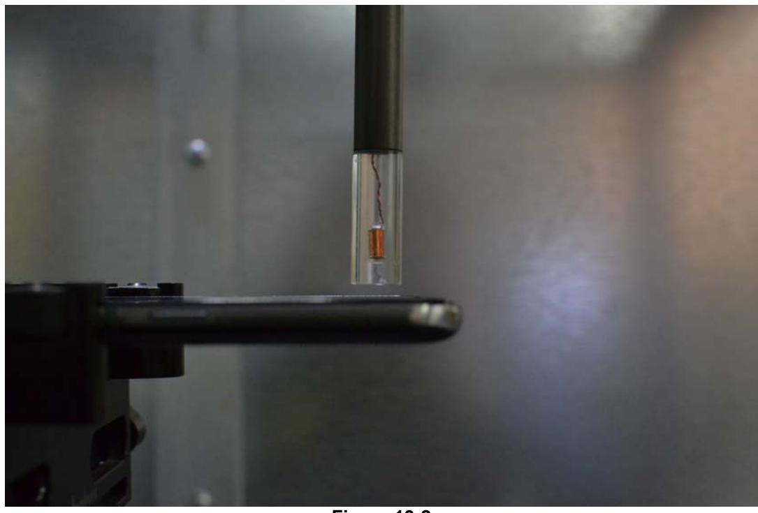
Figure 13-2 Test Setup for Wireless Device