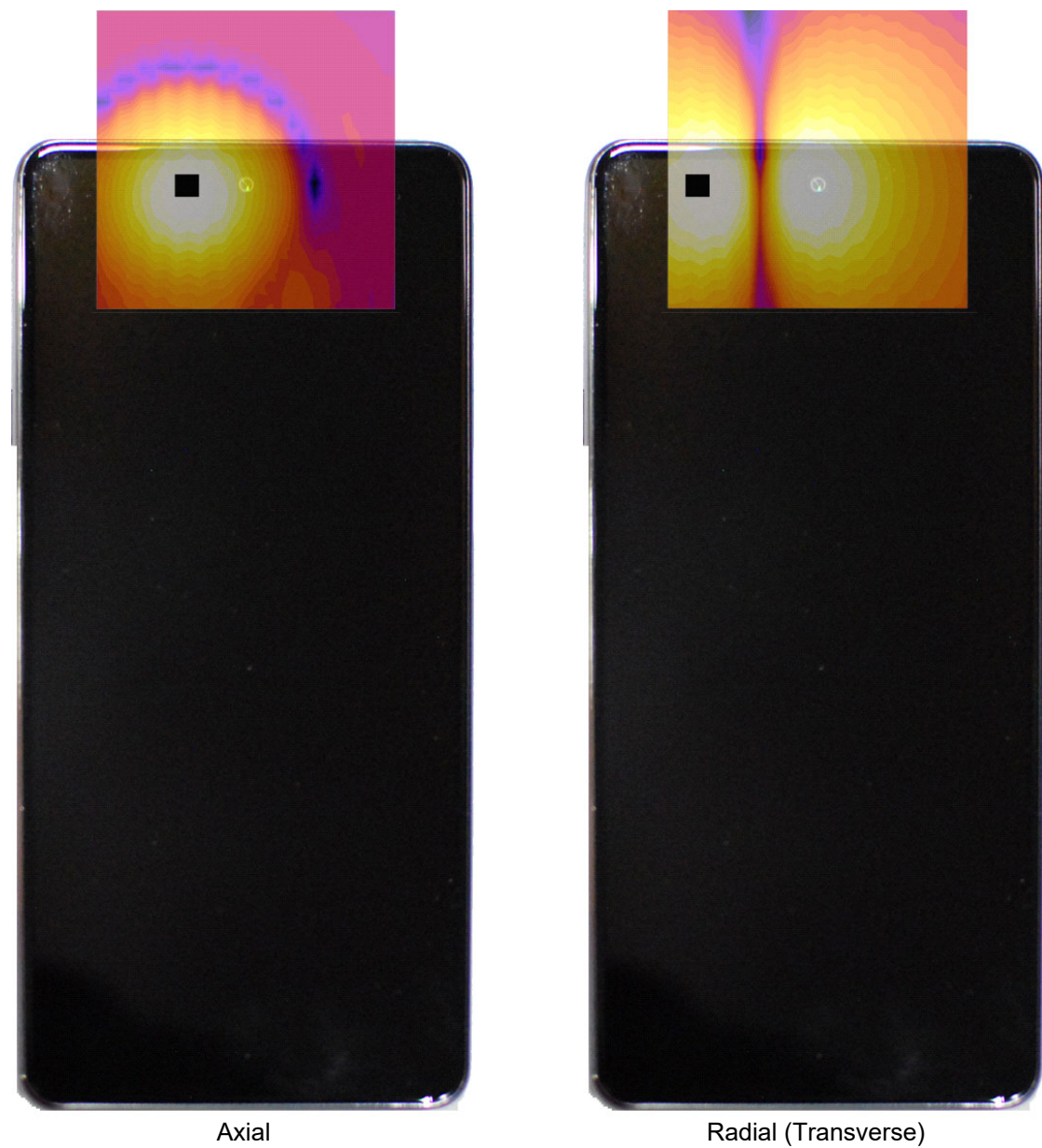
Figure 16-3 T-Coil Scan Overlay Magnetic Field Distributions

Note: Final measurement locations are indicated by a cursor on the contour plots.