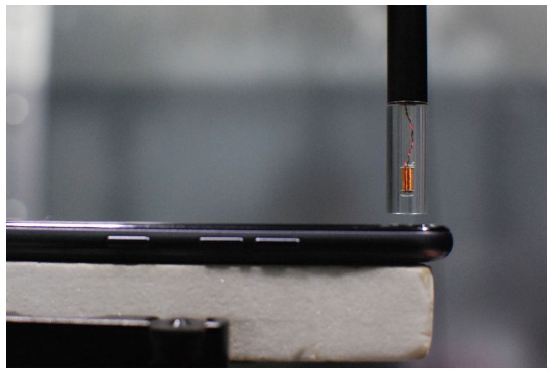
Figure 15-2 Test Setup for Wireless Device