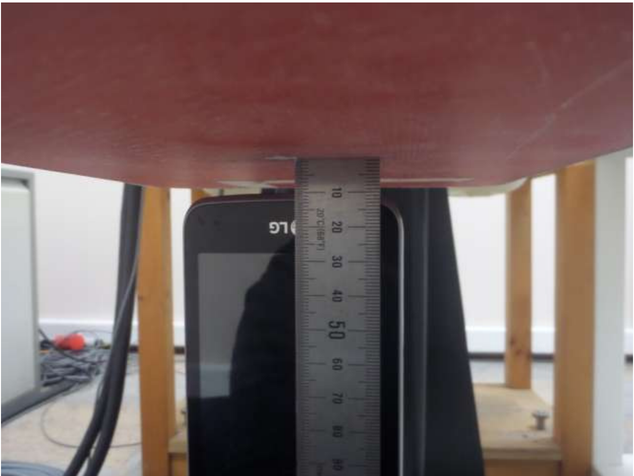
[Distance of 1.0 cm from the EUT]