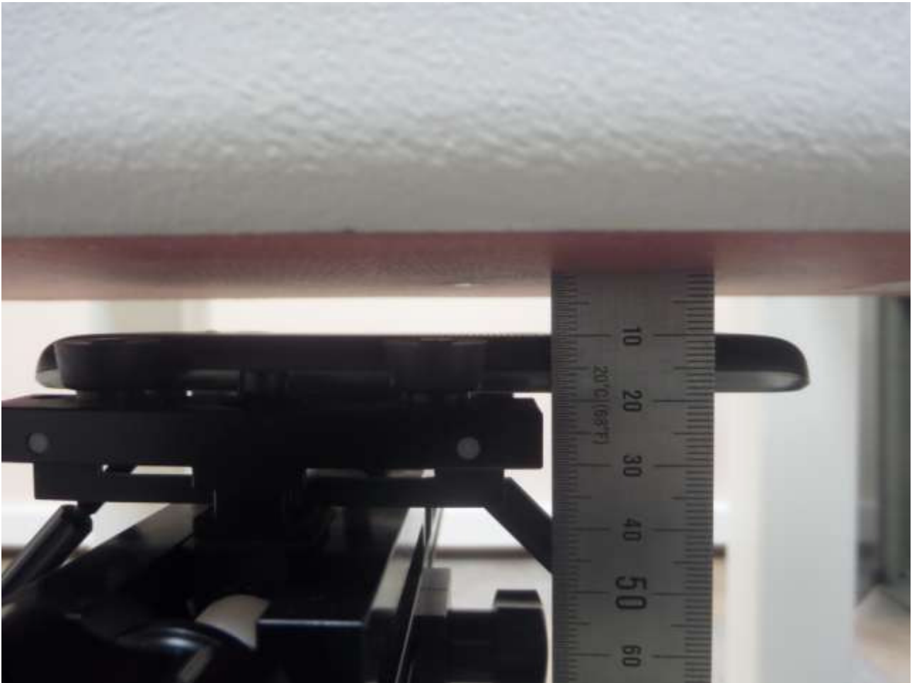
[Distance of 1.0 cm from the EUT]