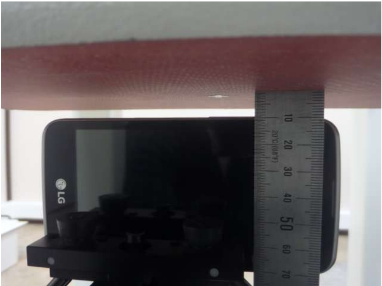
[Distance of 1.0 cm from the EUT]