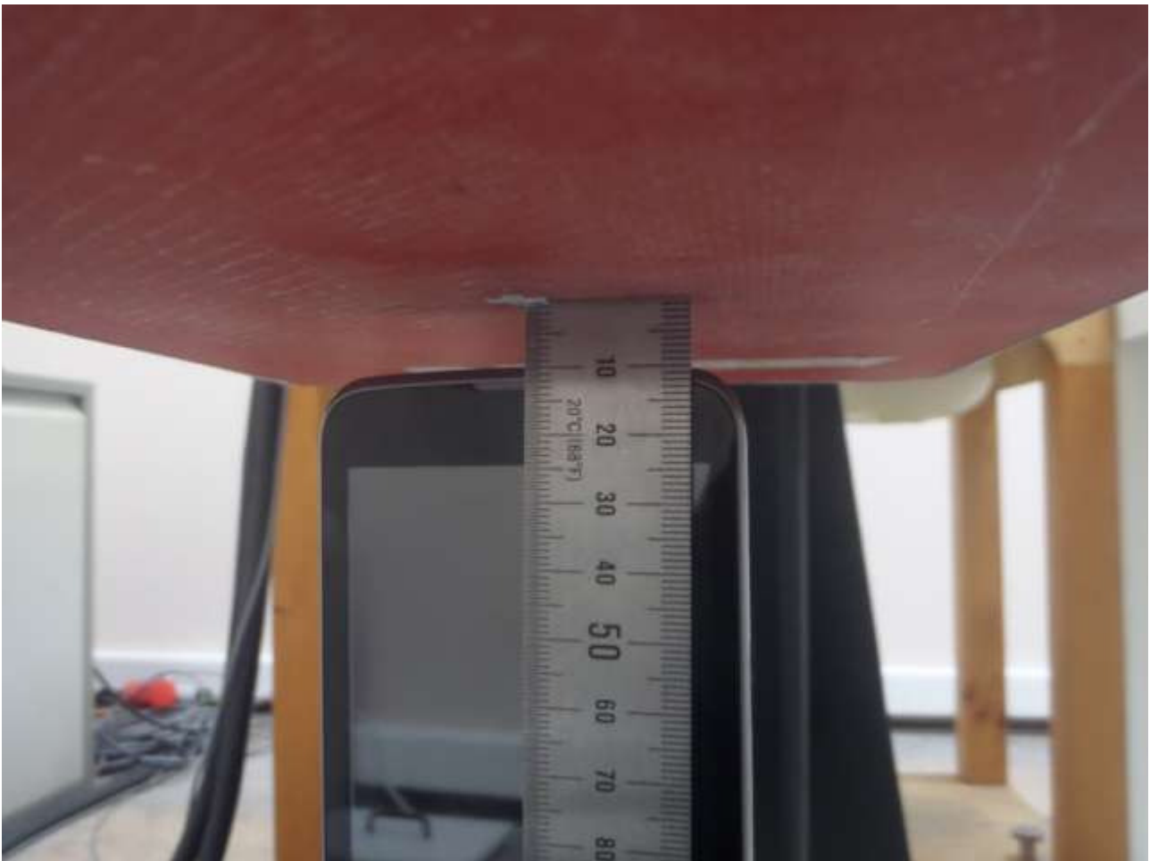
[Distance of 1.0 cm from the EUT]