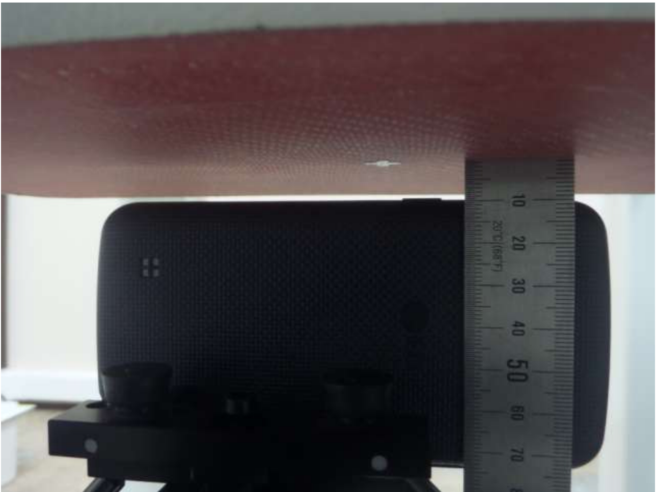
[Distance of 1.0 cm from the EUT]