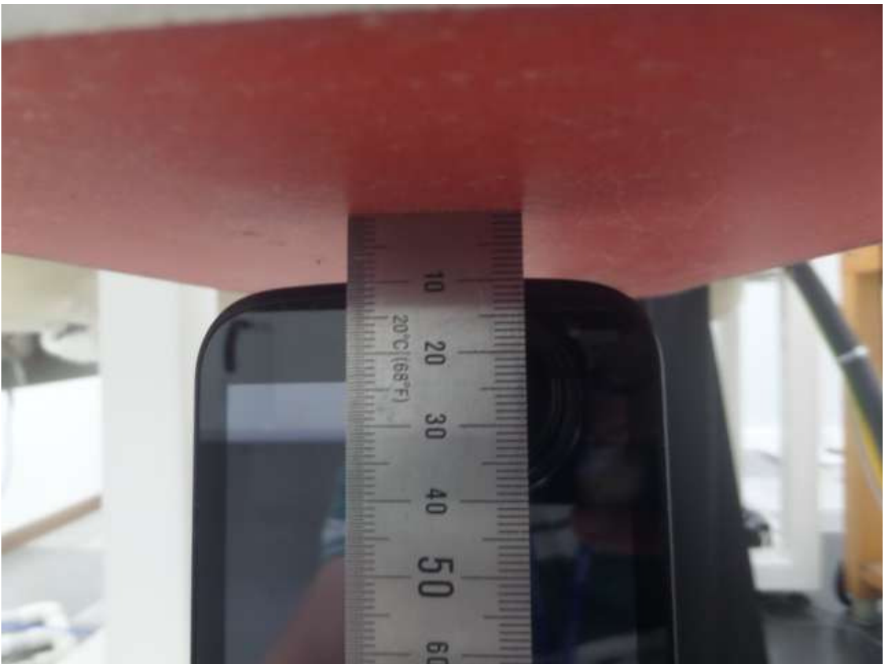
[Distance of 1.0 cm from the EUT]