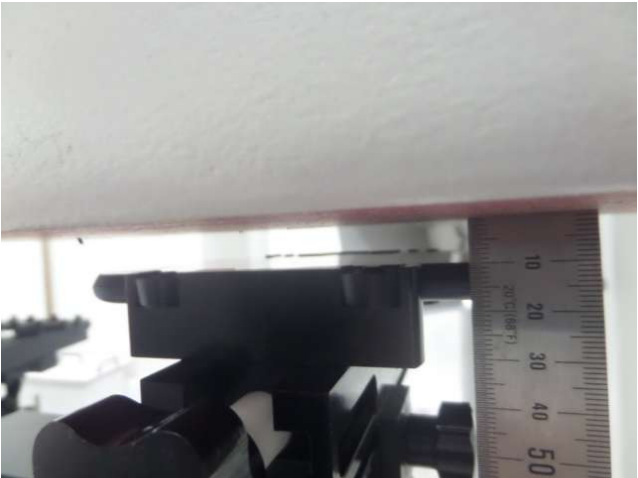
[Distance of 1.0 cm from the EUT]