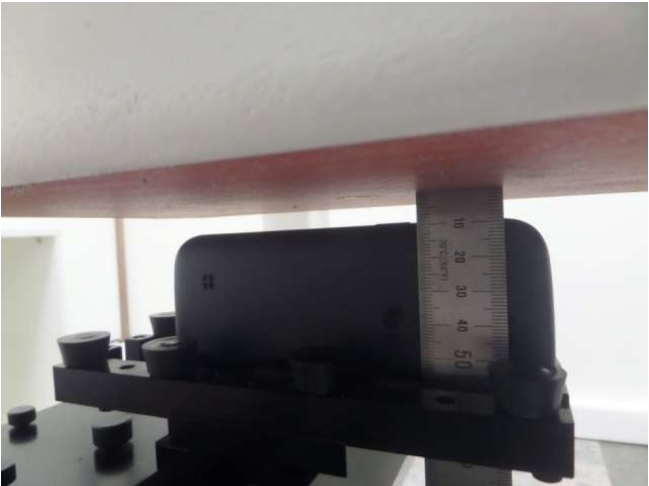
[Distance of 1.0 cm from the EUT]