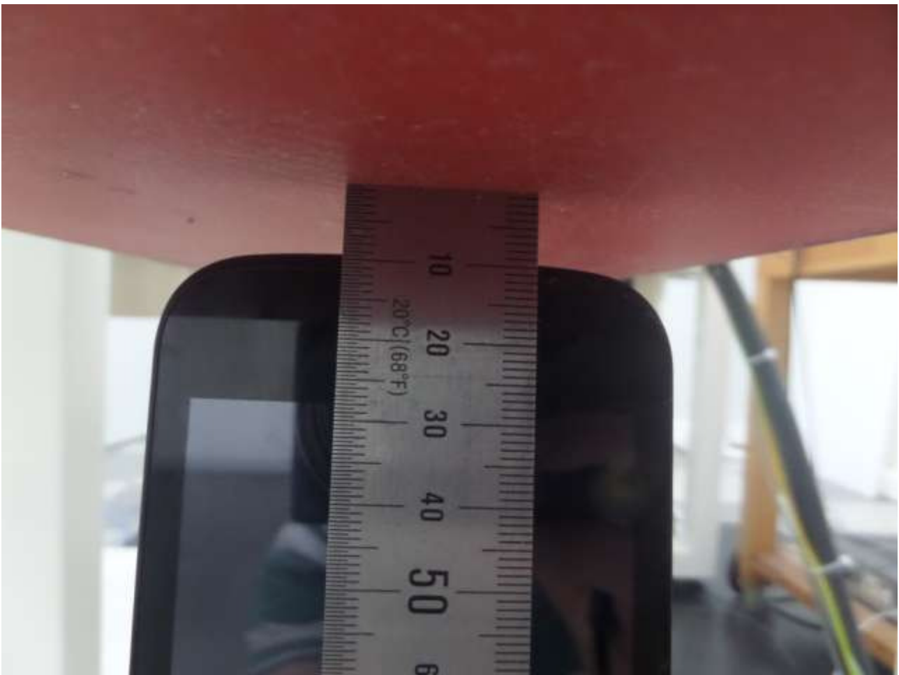
[Distance of 1.0 cm from the EUT]