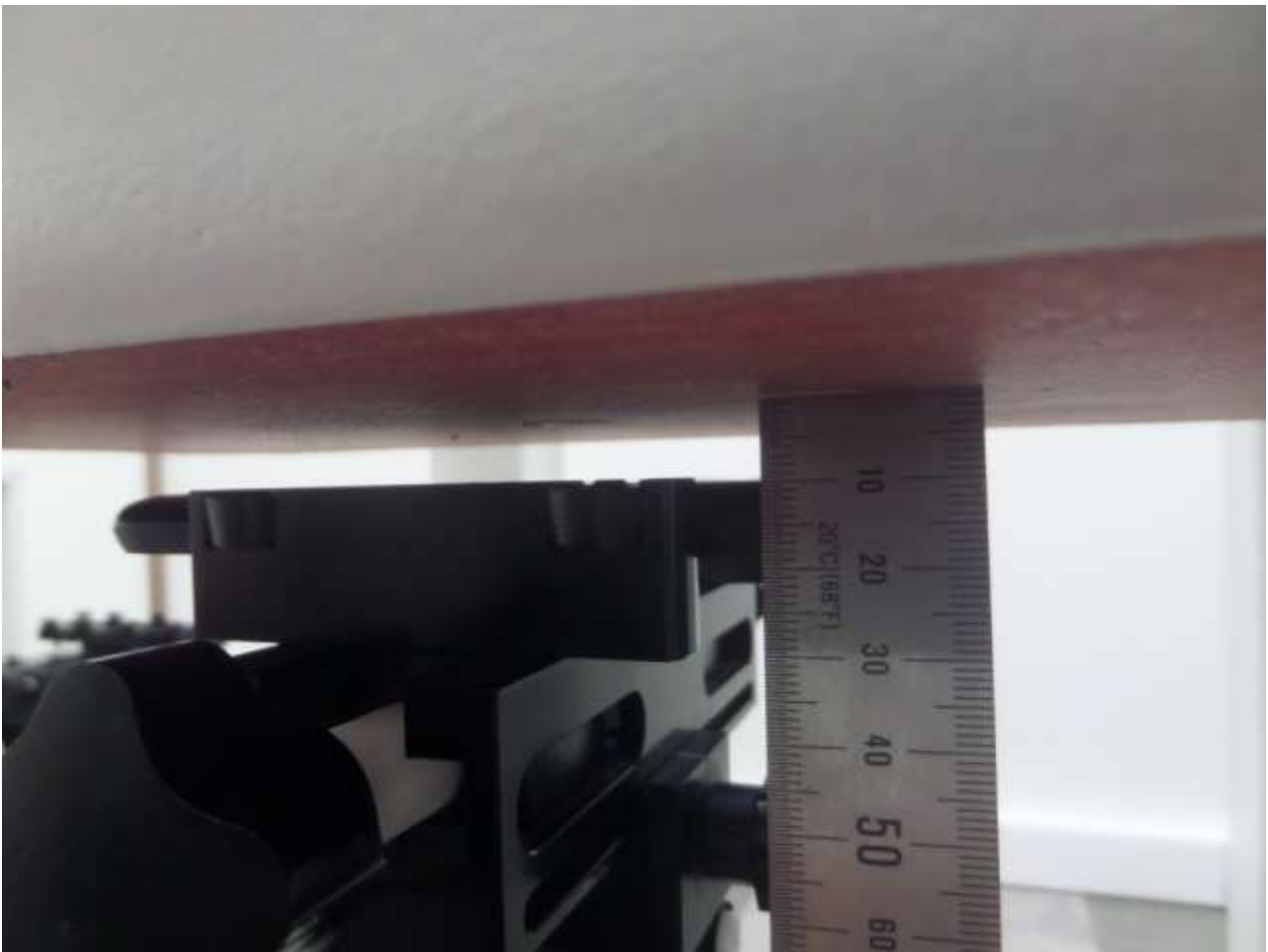
[Distance of 1.0 cm from the EUT]