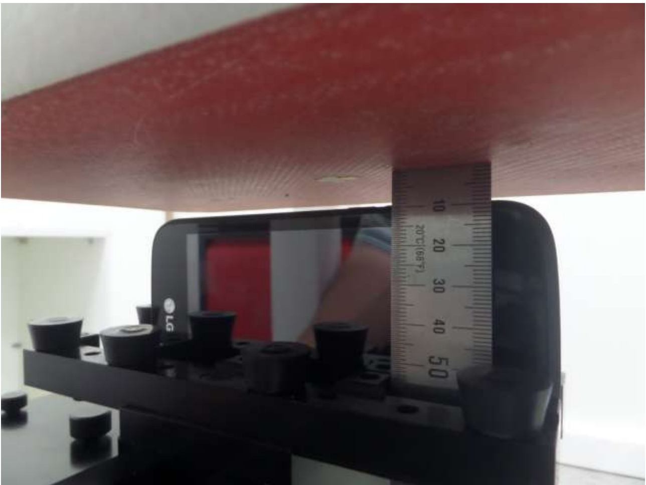
[Distance of 1.0 cm from the EUT]