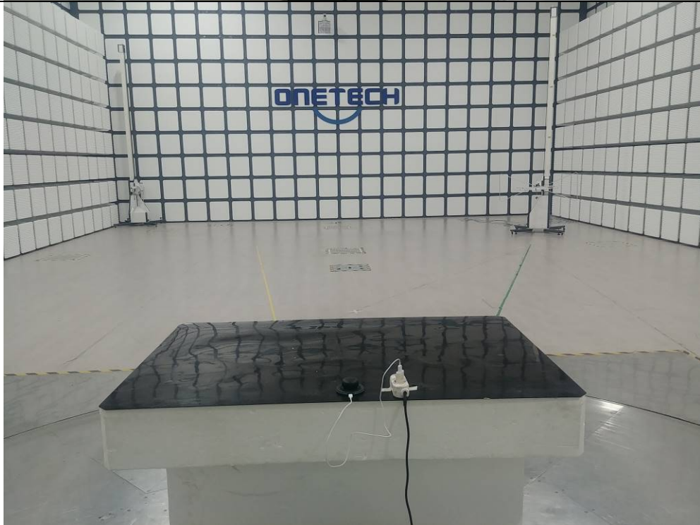
Test Mode 2 (Wireless Charging)