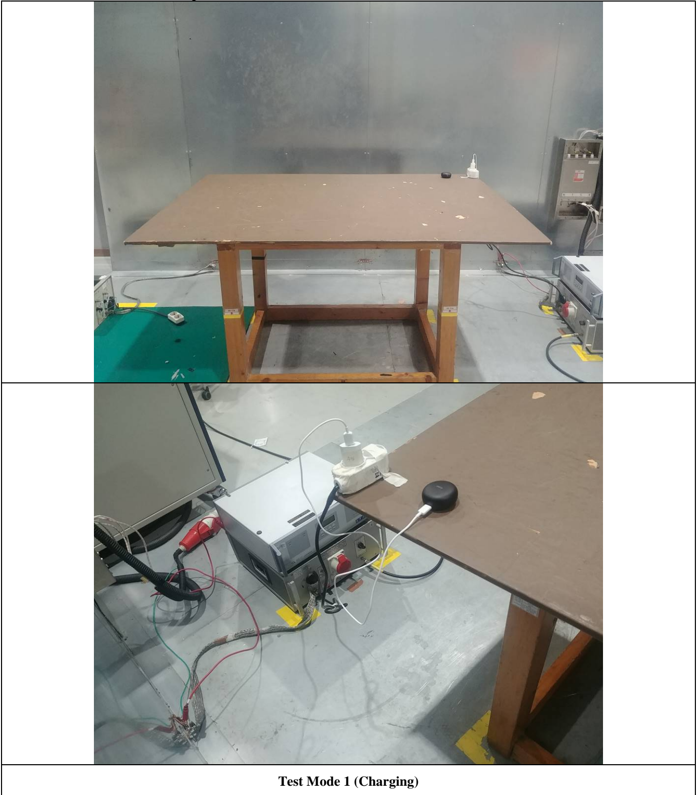
Test Mode 1 (Charging)