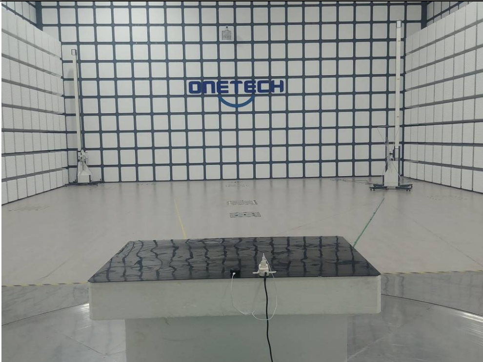
Test Mode 1 (Charging)