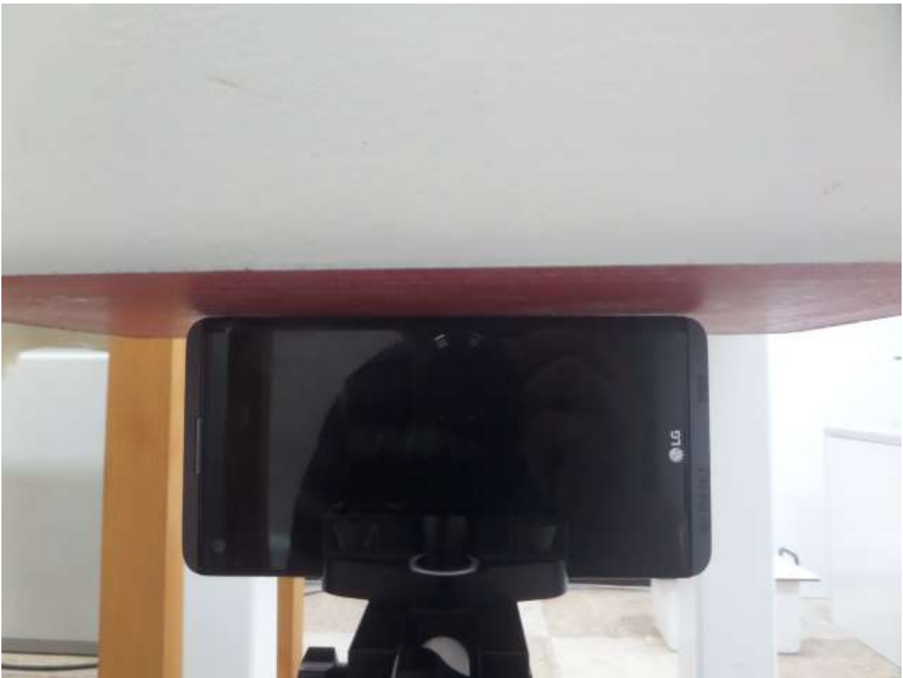
[Distance of 0 cm from the EUT]