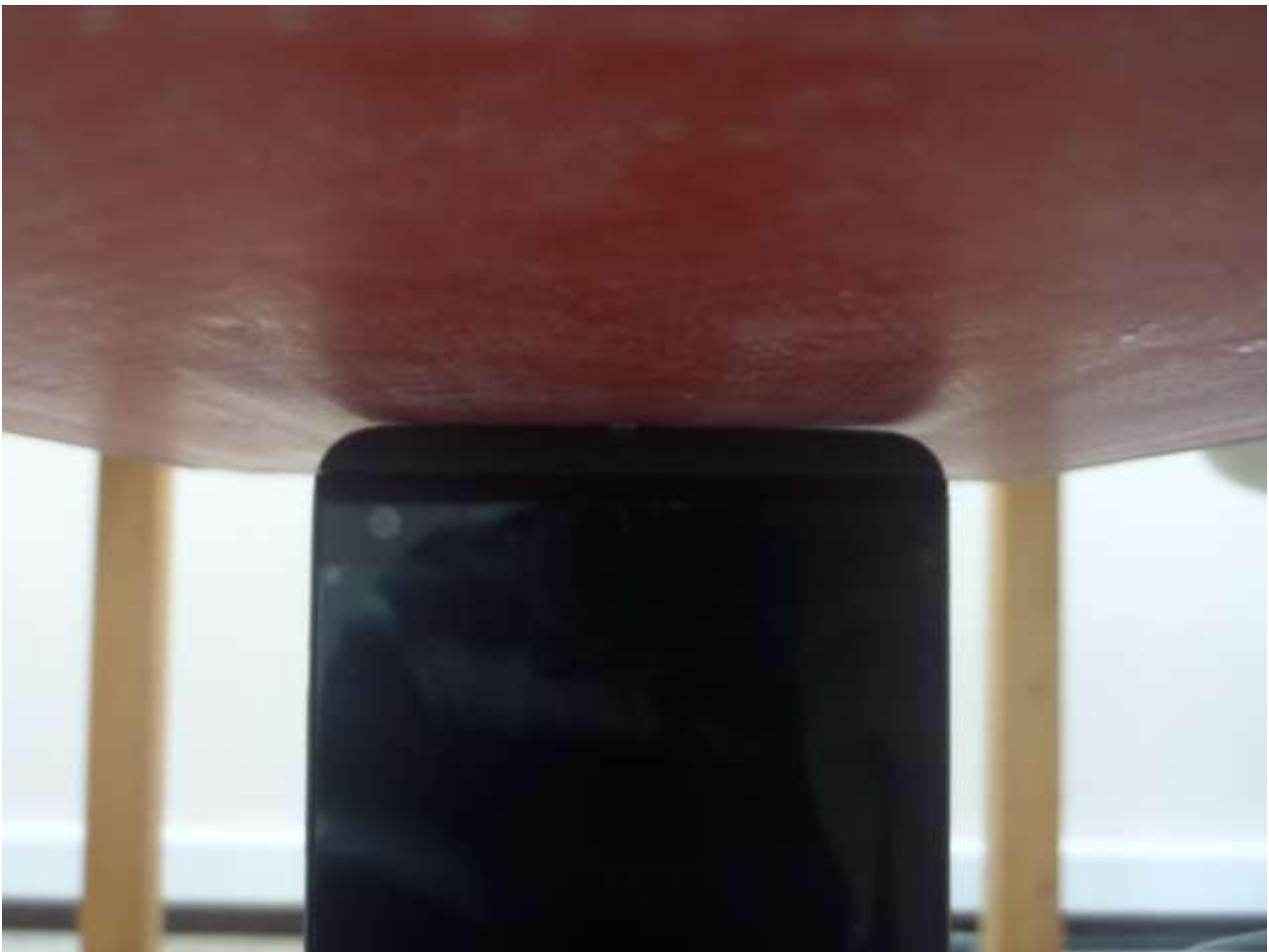
[Distance of 0 cm from the EUT]