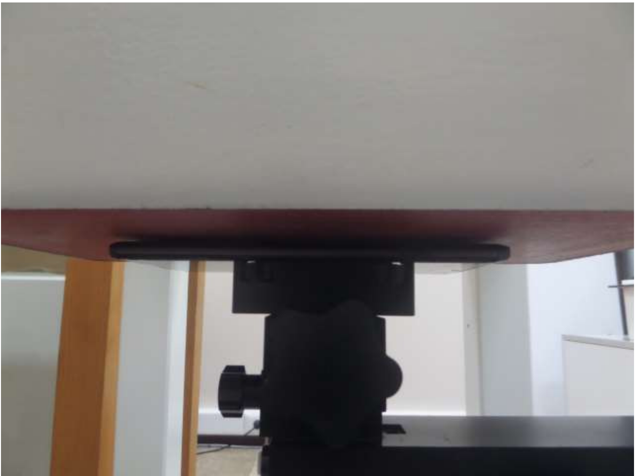
[Distance of 0 cm from the EUT]