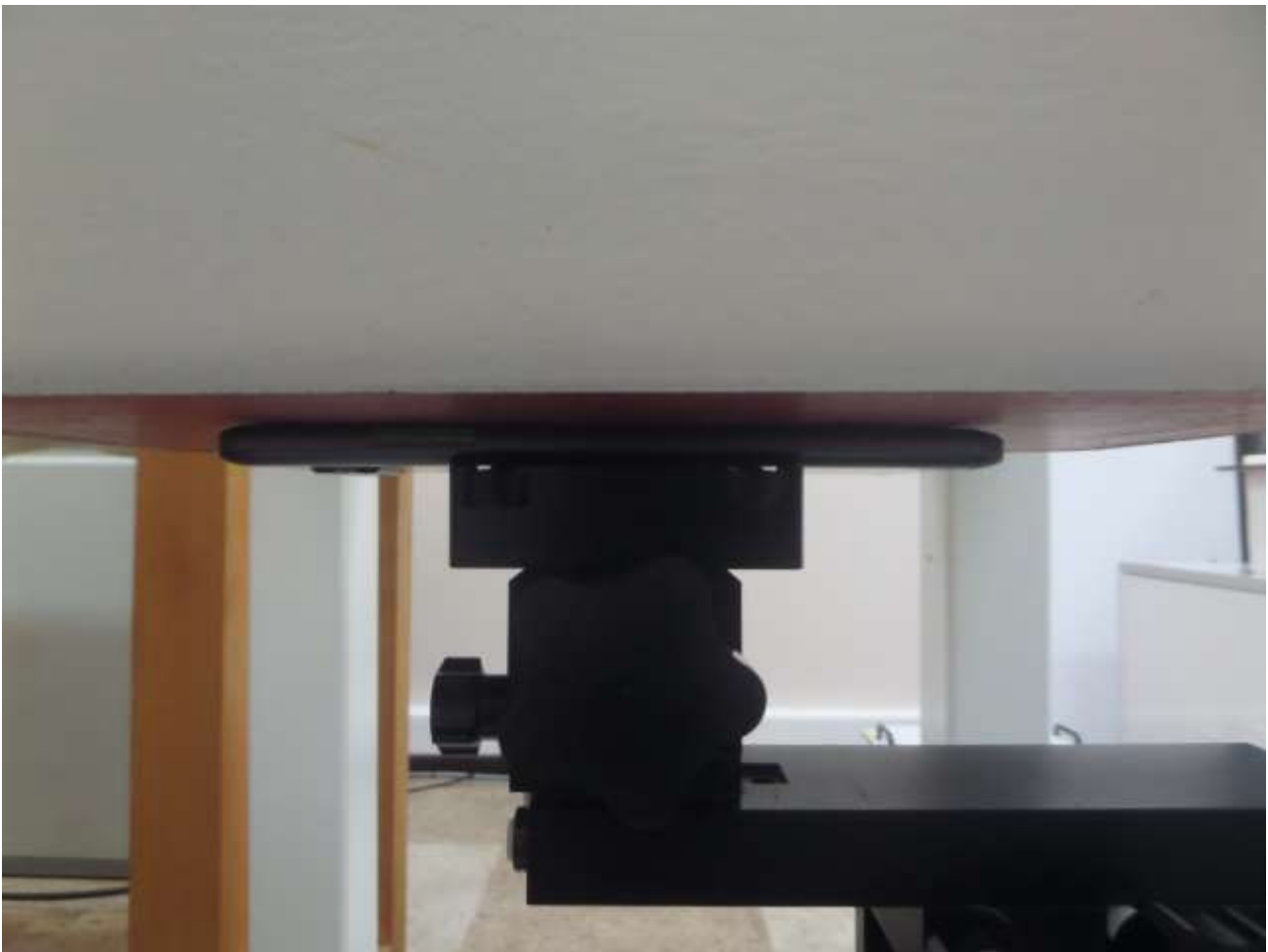
[Distance of 0 cm from the EUT]