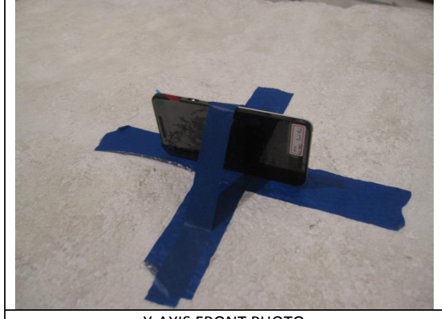
Y-AXIS FRONT PHOTO