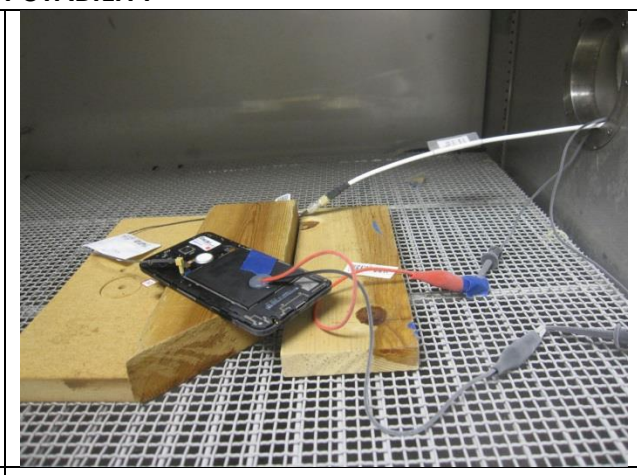
ANTENNA PORT CONDUCTED PHOTO