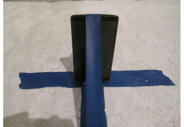
Z-AXIS FRONT PHOTO