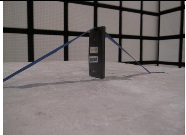
Z-AXIS FRONT PHOTO