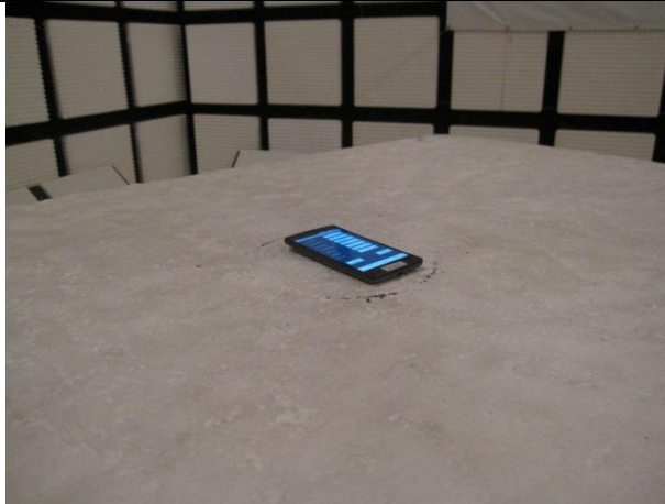
X-AXIS FRONT PHOTO