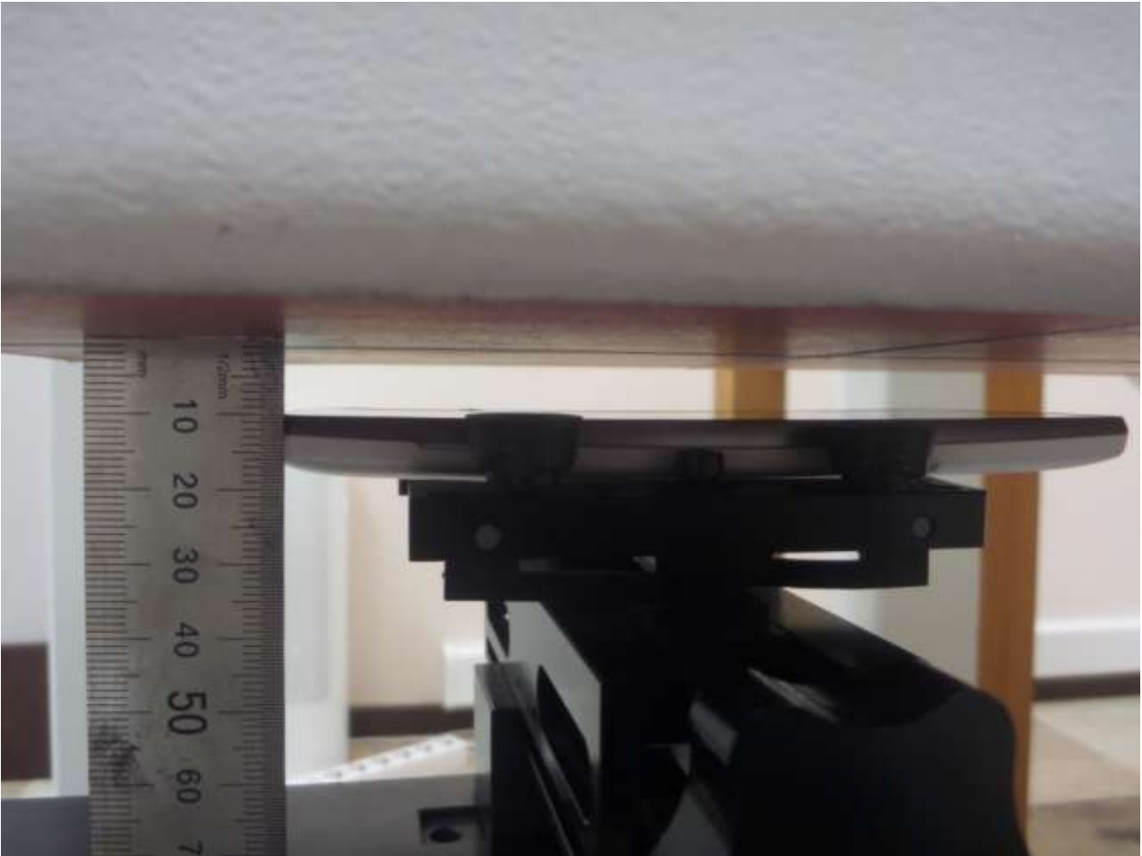
[Distance of 1.0 cm from the EUT]