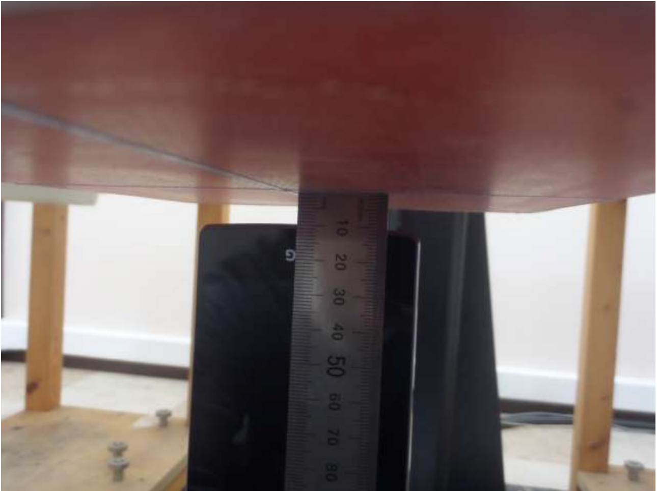
[Distance of 1.0 cm from the EUT]