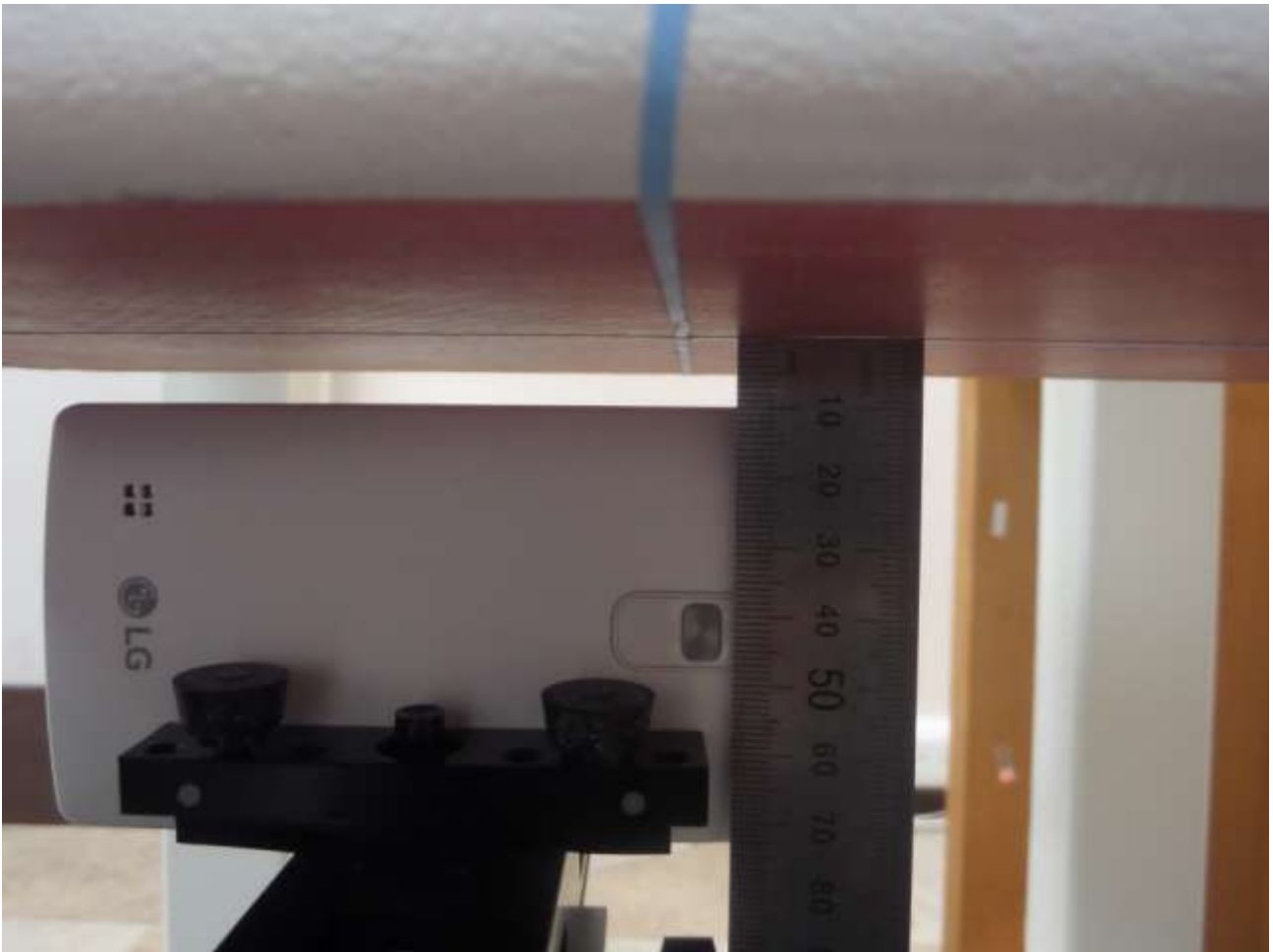
[Distance of 1.0 cm from the EUT]