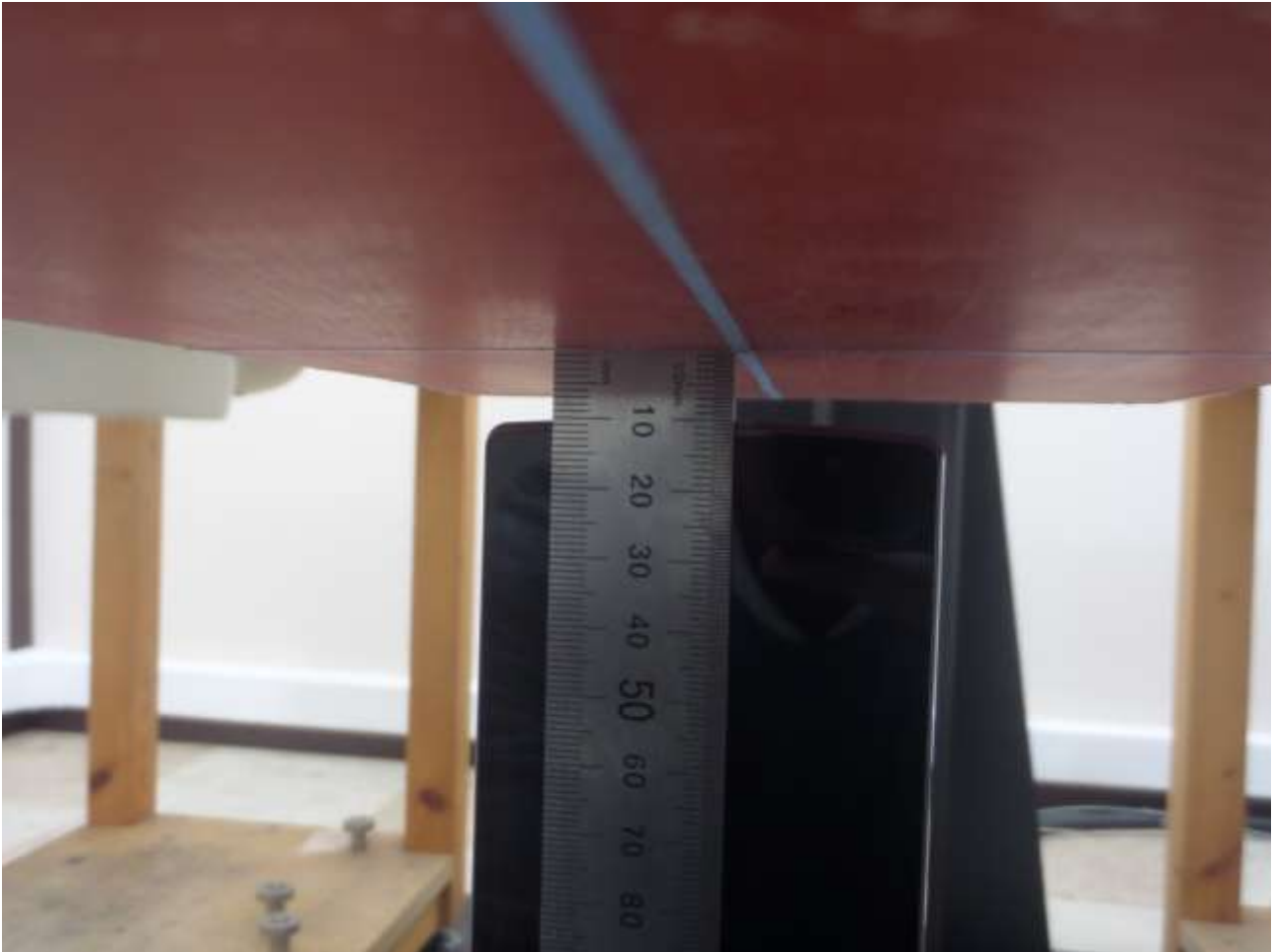
[Distance of 1.0 cm from the EUT]