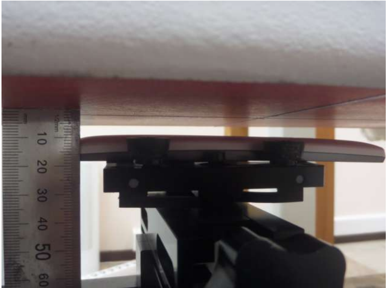
[Distance of 1.0 cm from the EUT]