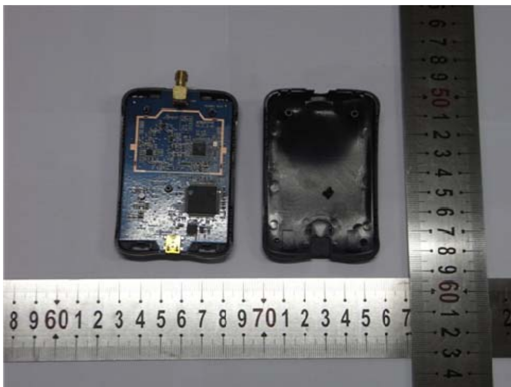
INTERNAL PHOTO OF SAMPLE - 1