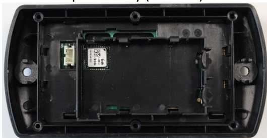
TU501-1 Top with Inlay (and PCB)