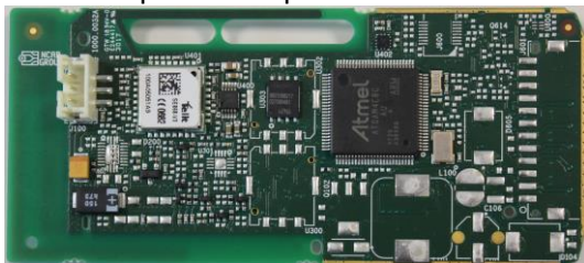
TU501-1 Spot PCB Top side