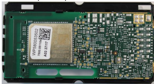
TU501-1 Spot Inlay bottom with PCB