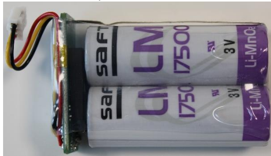
TU501-1 Battery Pack