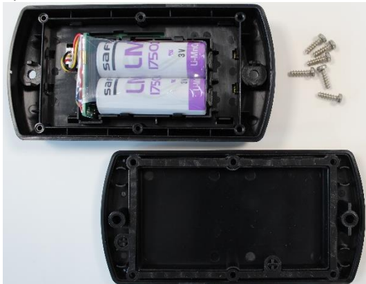
Spot TU501-1 disassembled