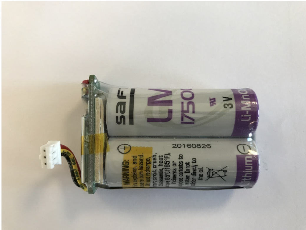
Battery pack with two LM17500 cells (LiMnO 2 /3V).