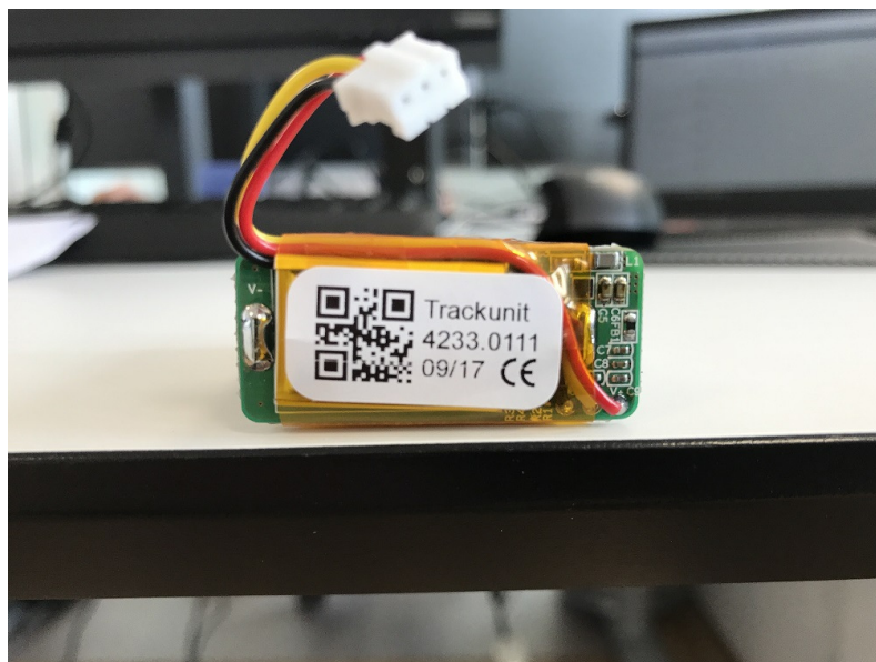
Battery pack with product label.