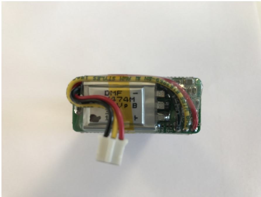
Battery pack top view with PCB and connector.