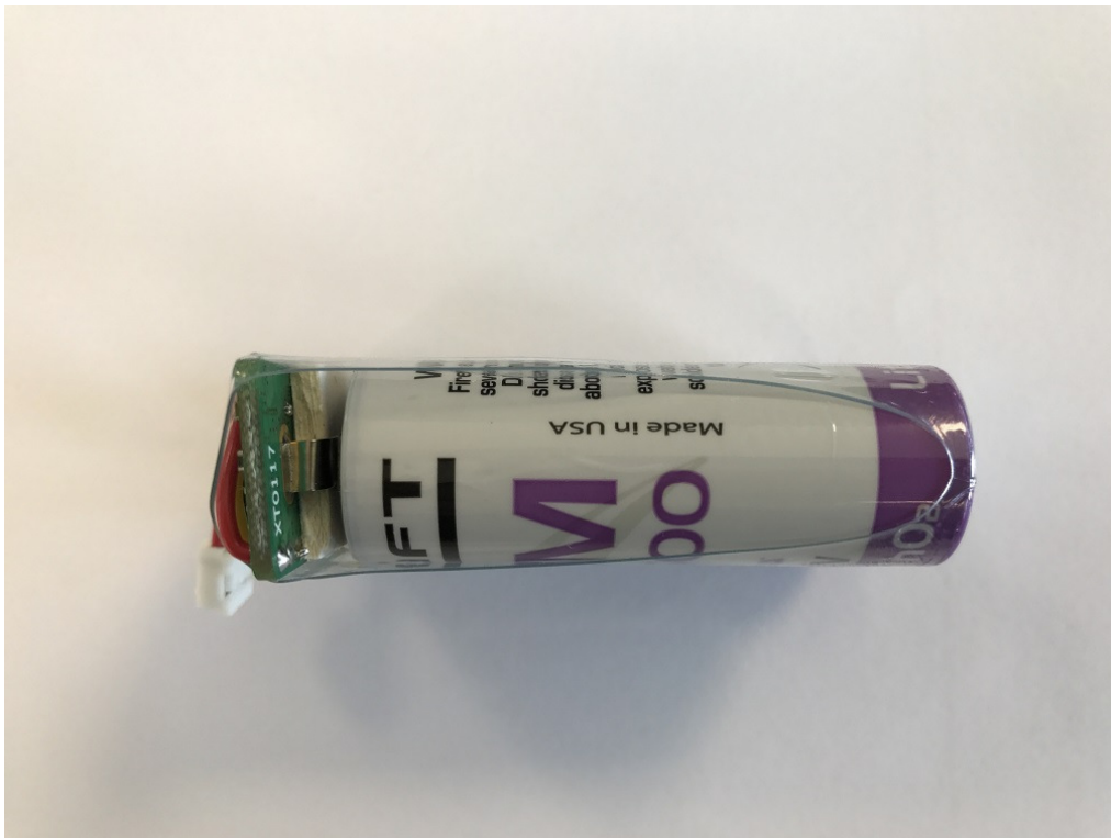
Battery pack side view