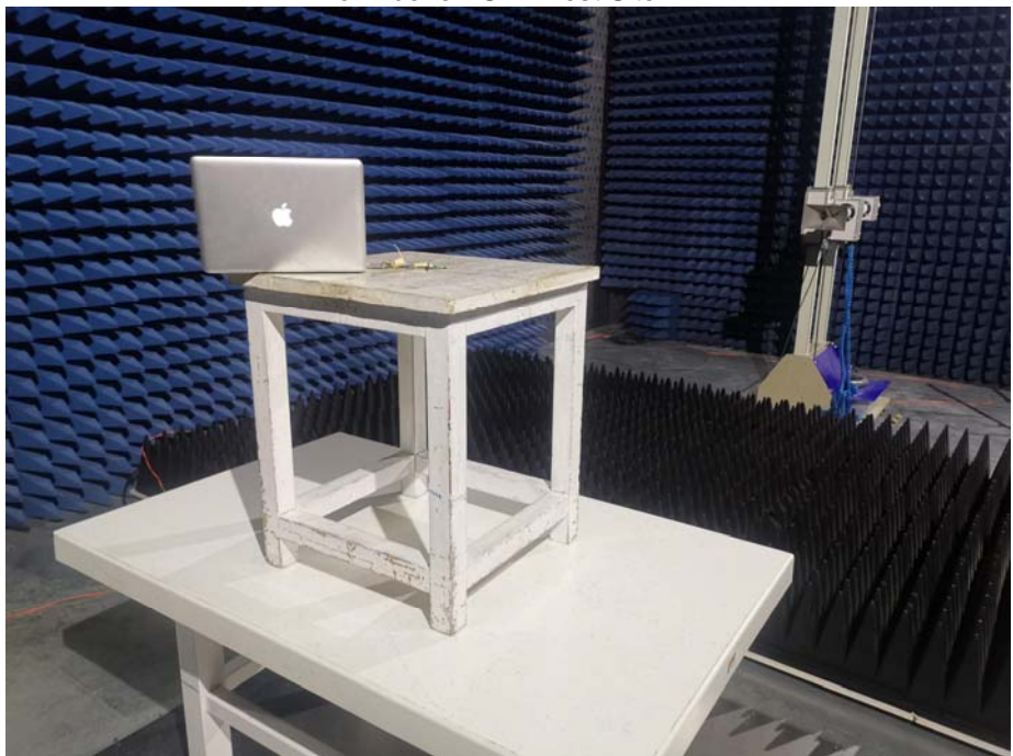
For Above 1GHz Test Site 1#