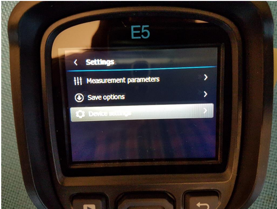
Figur 1 Placement of PMN E5.

Placement of PMN in FLIR-E6390 camera and how to reach regulatory information.