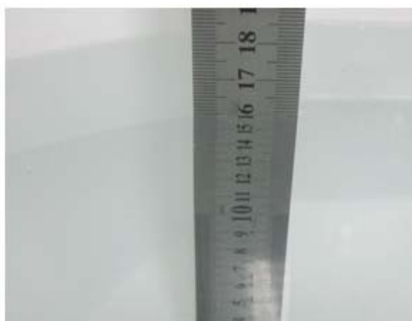
Liquid Height for Body SAR

For the measurement of the field distribution inside the SAM phantom with SMTIMO, the phantom must be filled with around 25 liters of homogeneous body tissue simulating liquid. For head SAR testing, the liquid height from the ear reference point (ERP) of the phantom to the liquid top surface is larger than 15 cm. For body SAR testing, the liquid height from the center of the flat phantom to the liquid top surface is larger than 15 cm. Please see the following photos for the liquid height.