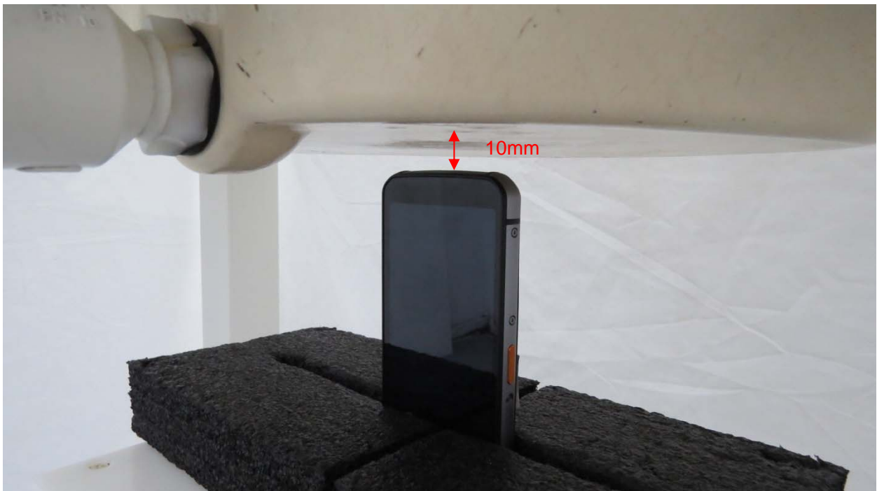
Picture 2: Bottom Edge, the distance from handset to the bottom of the Phantom is 10mm