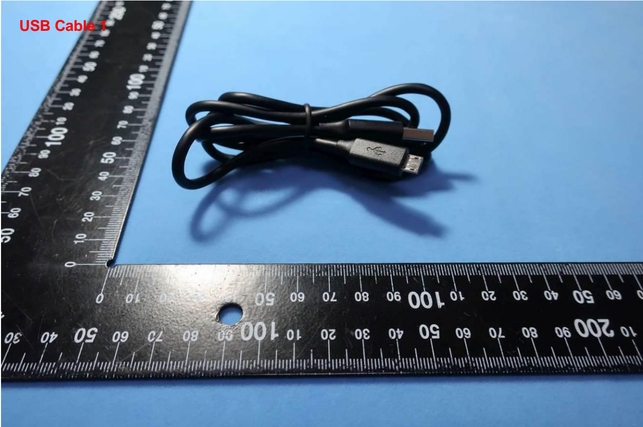
USB Cable 1