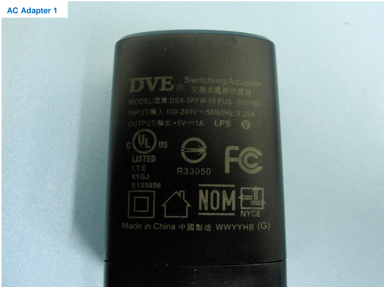
AC Adapter 1

Brand Name: CAT / Model Name: S40 / Marketing Name: S40