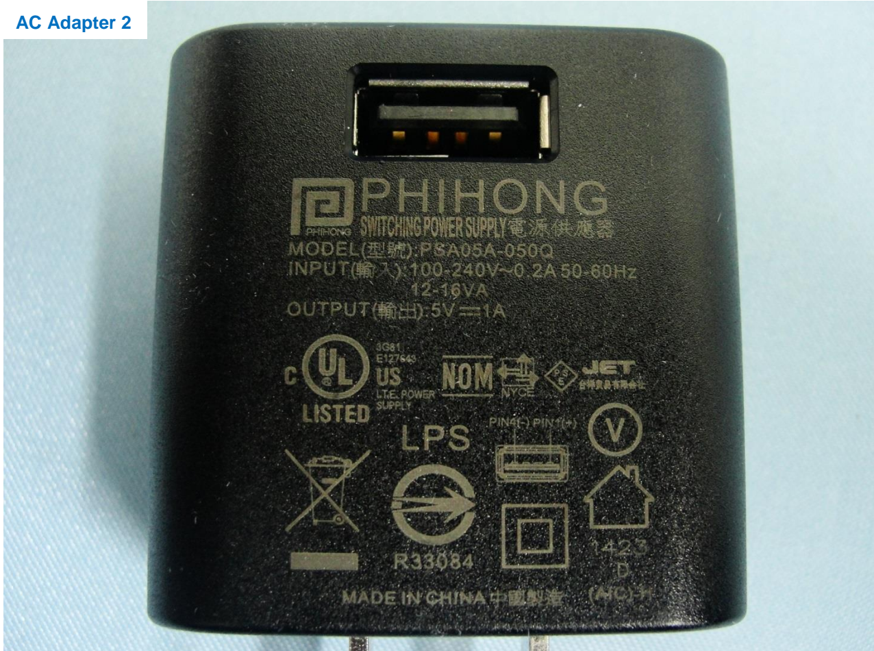
AC Adapter 2

Brand Name: CAT / Model Name: S40 / Marketing Name: S40