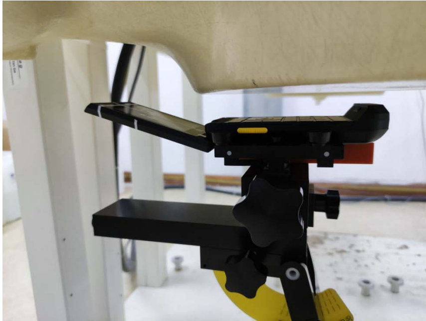
Front Side for Open the Flip (Test distance: 10mm)