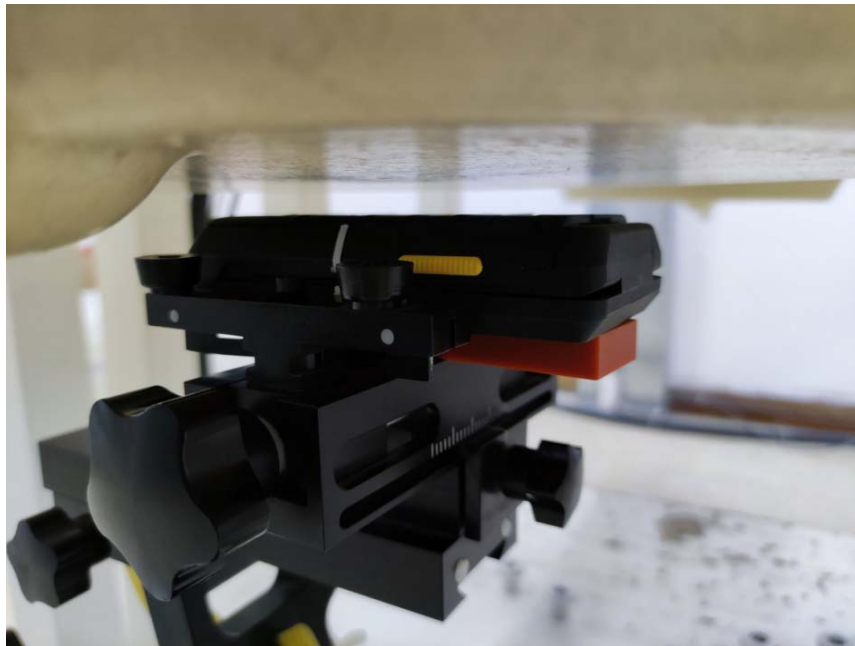
Back Side (Test distance: 10mm)