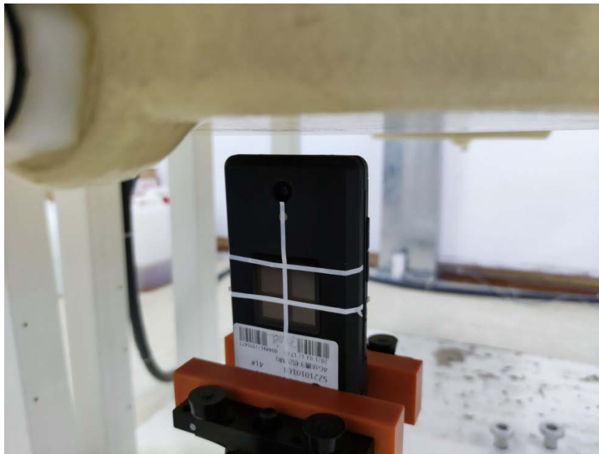
Top Side (Test distance: 10mm)