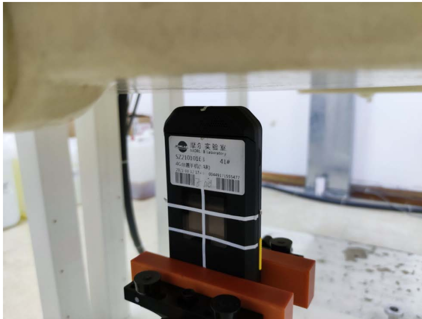
Bottom Side (Test distance: 10mm)