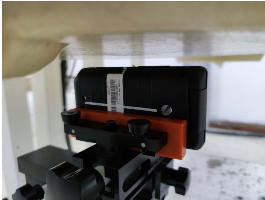
Right Side (Test distance: 10mm)