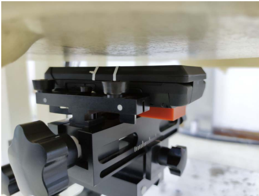
Front Side (Test distance: 10mm)