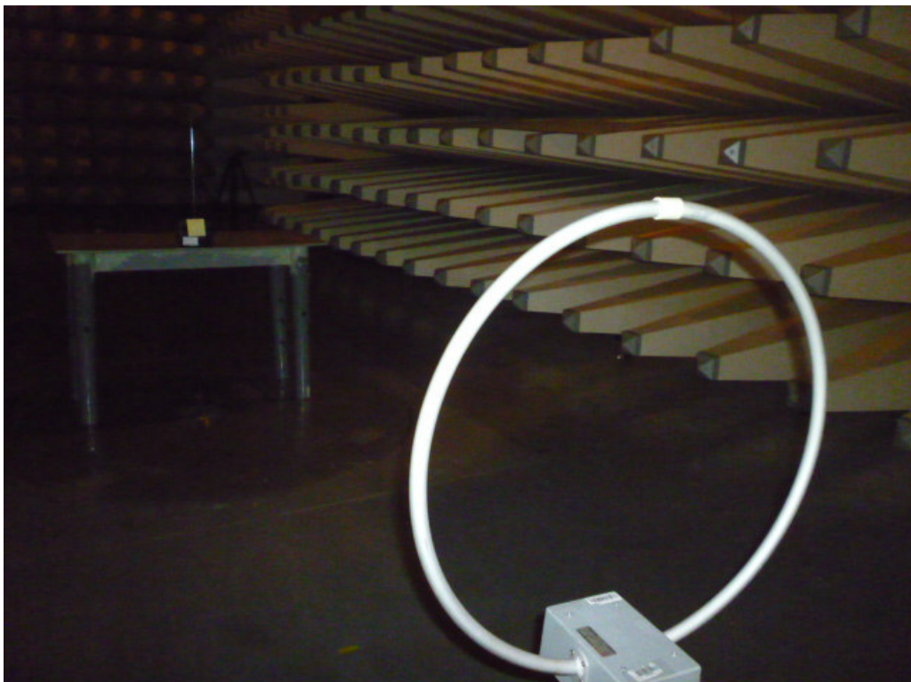
Set-up for Radiation Emission (Transmitter)