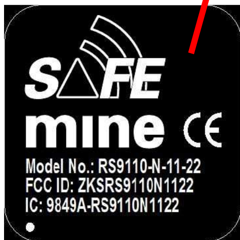
Label Wifi Module

Print Technology: Thermal transfer Materials Type: White polyester Finish: Glossy white Adhesive: Permanent acrylic