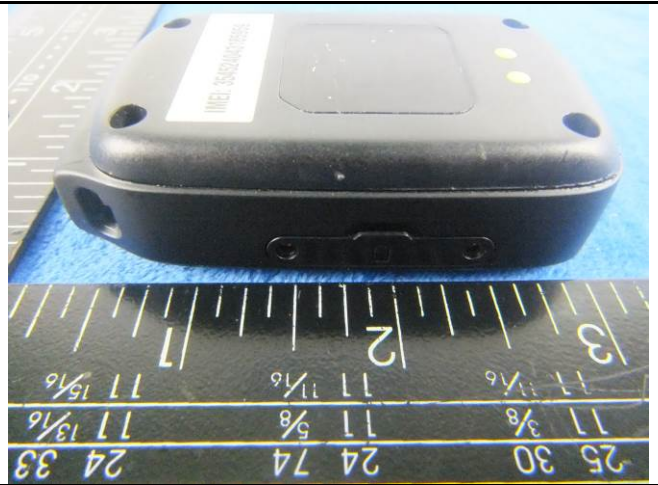
EUT - Right View