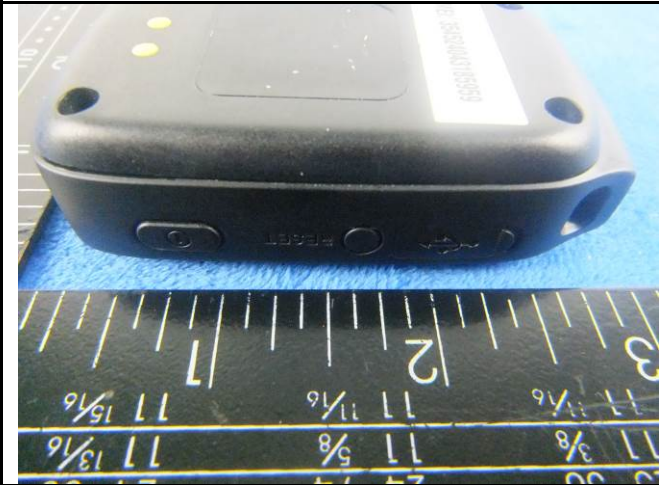
EUT - Left View