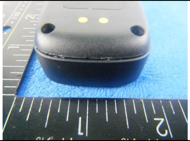
EUT - Bottom View