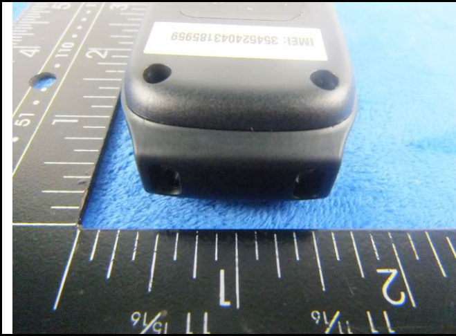
EUT - Top View