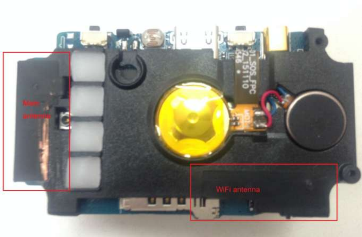
Picture of DUT's antenna