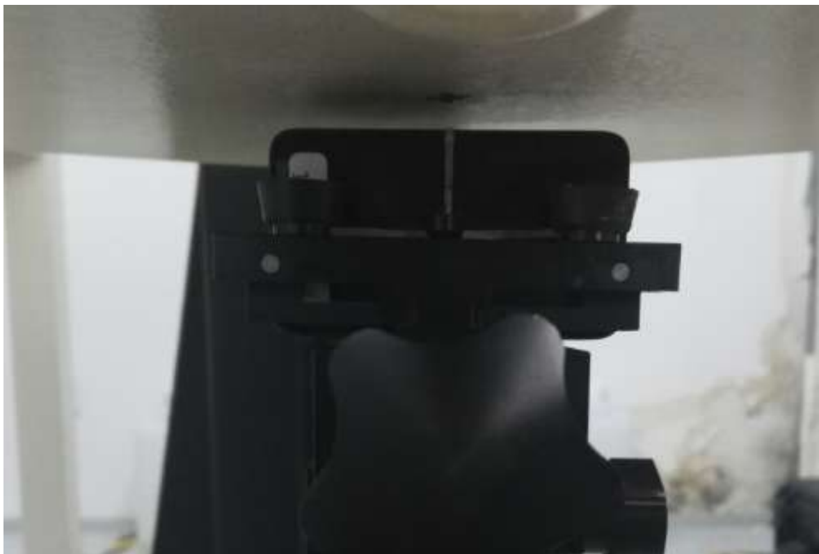
POSITION OF BODY right side 5mm DISTANCE