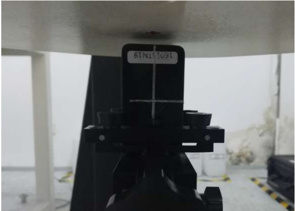
POSITION OF BODY back WITH 5mm DISTANCE