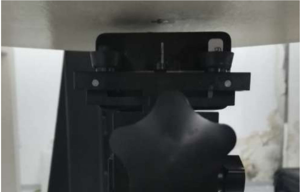
POSITION OF BODY left side WITH 5mm DISTANCE