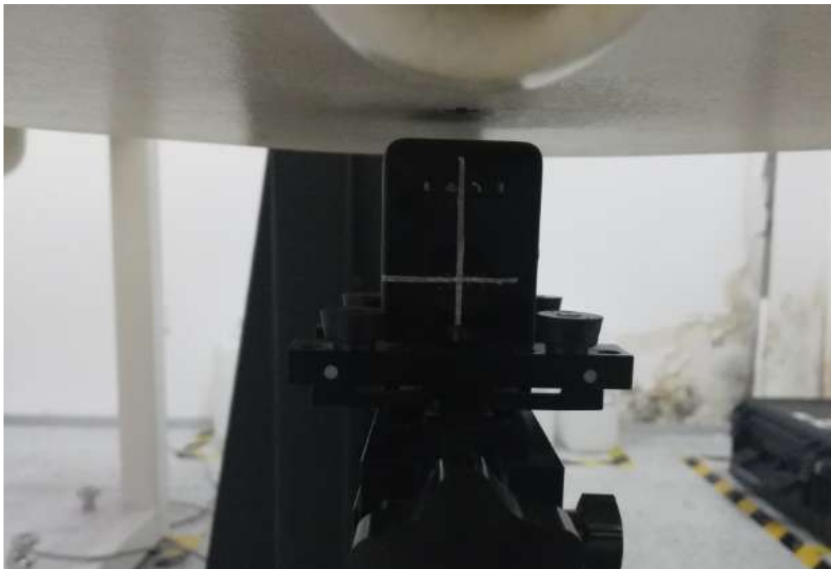
POSITION OF BODY front WITH 5mm DISTANCE