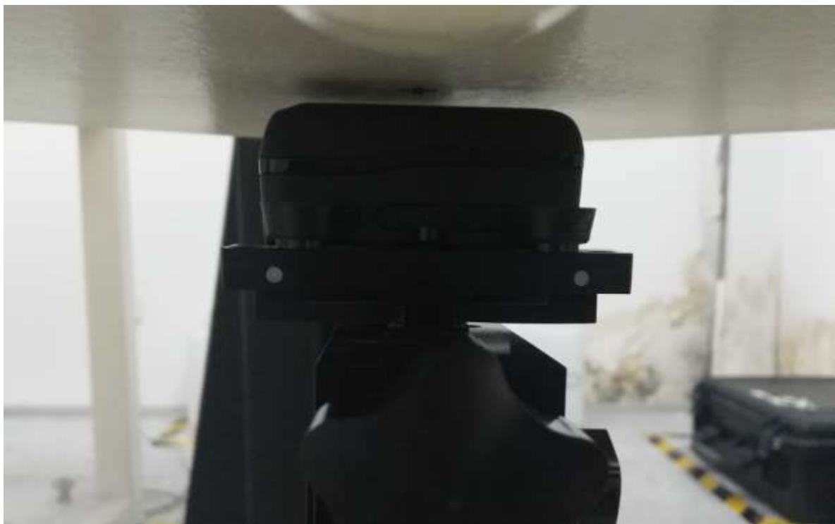
POSITION OF BODY TOWARDS GROUND WITH 5mm DISTANCE