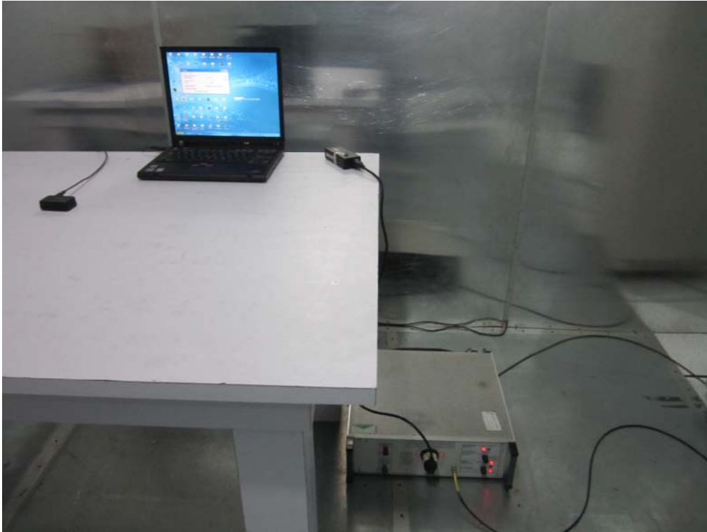
Conducted Emission test photo