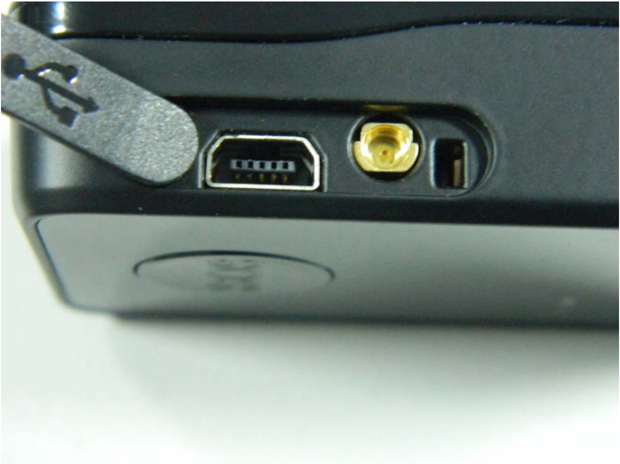
Fig.3 Appearance and ports (Side)