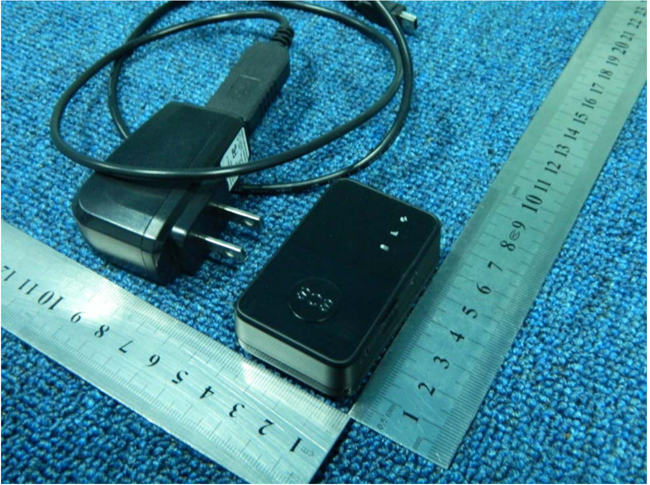
Fig.1 Appearance and size (obverse)