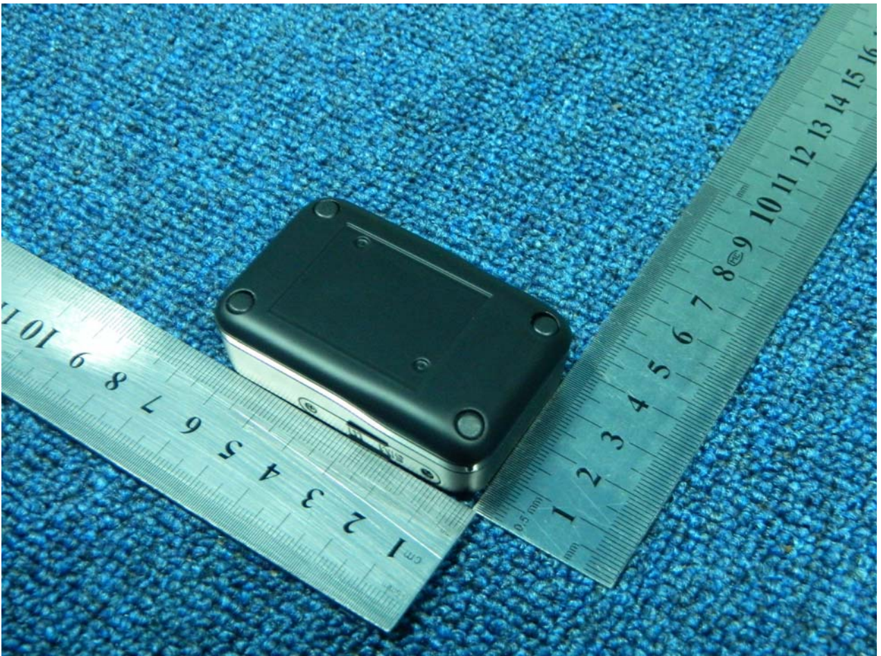
Fig.2 Appearance and size (reverse)