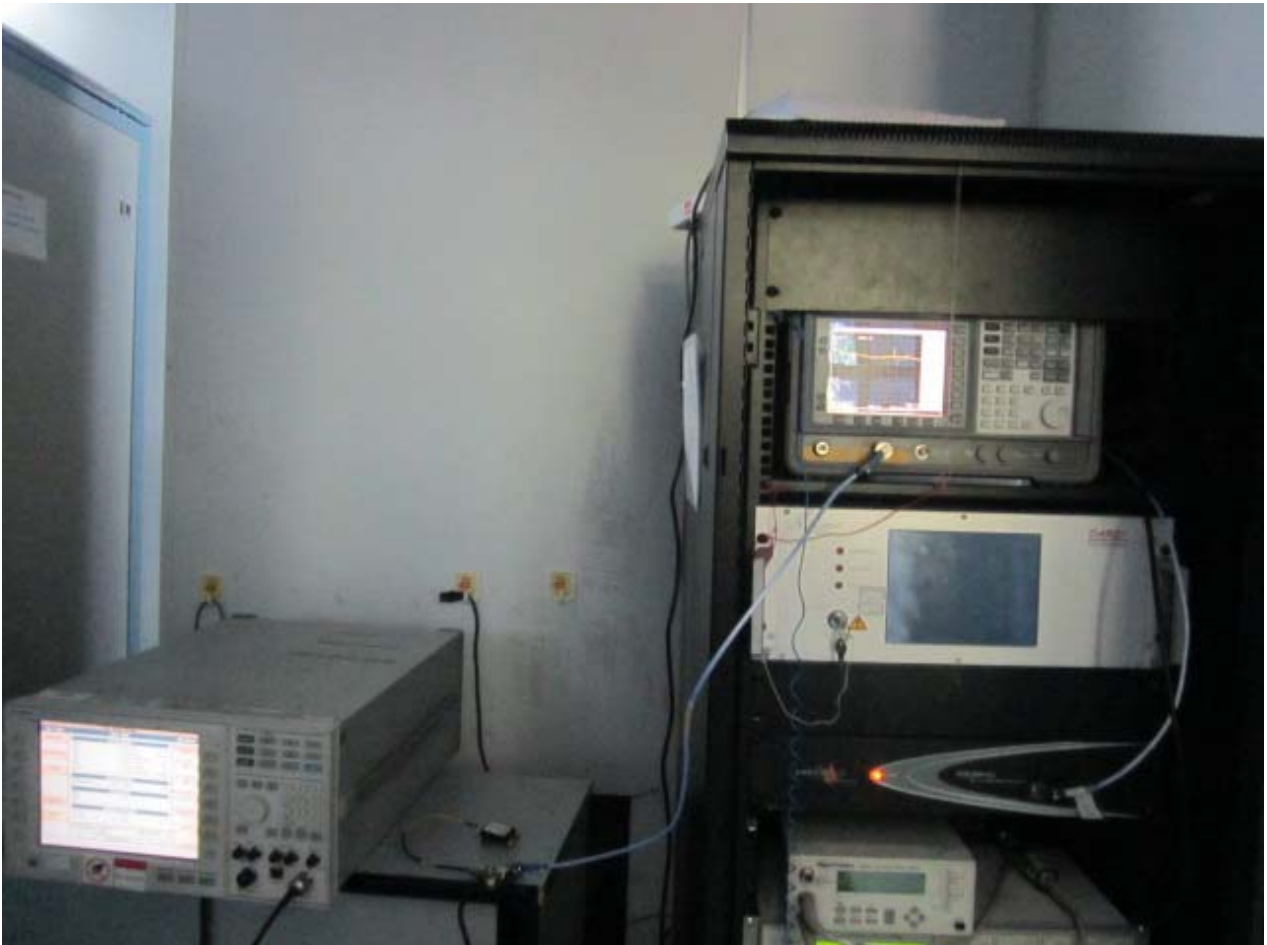
Fig. 4 RF Conducted test configuration