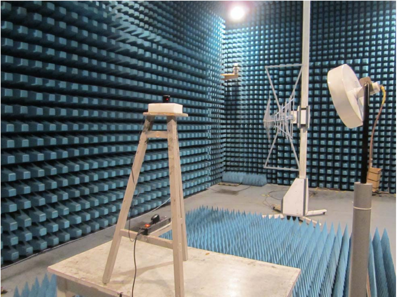
Fig. 5 RF Radiated test configuration