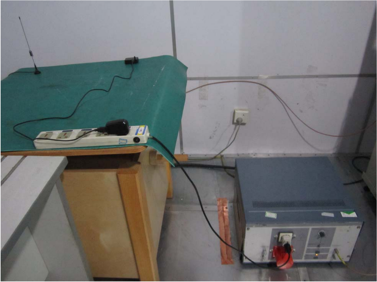
Fig. 1 Conducted emission test configuration