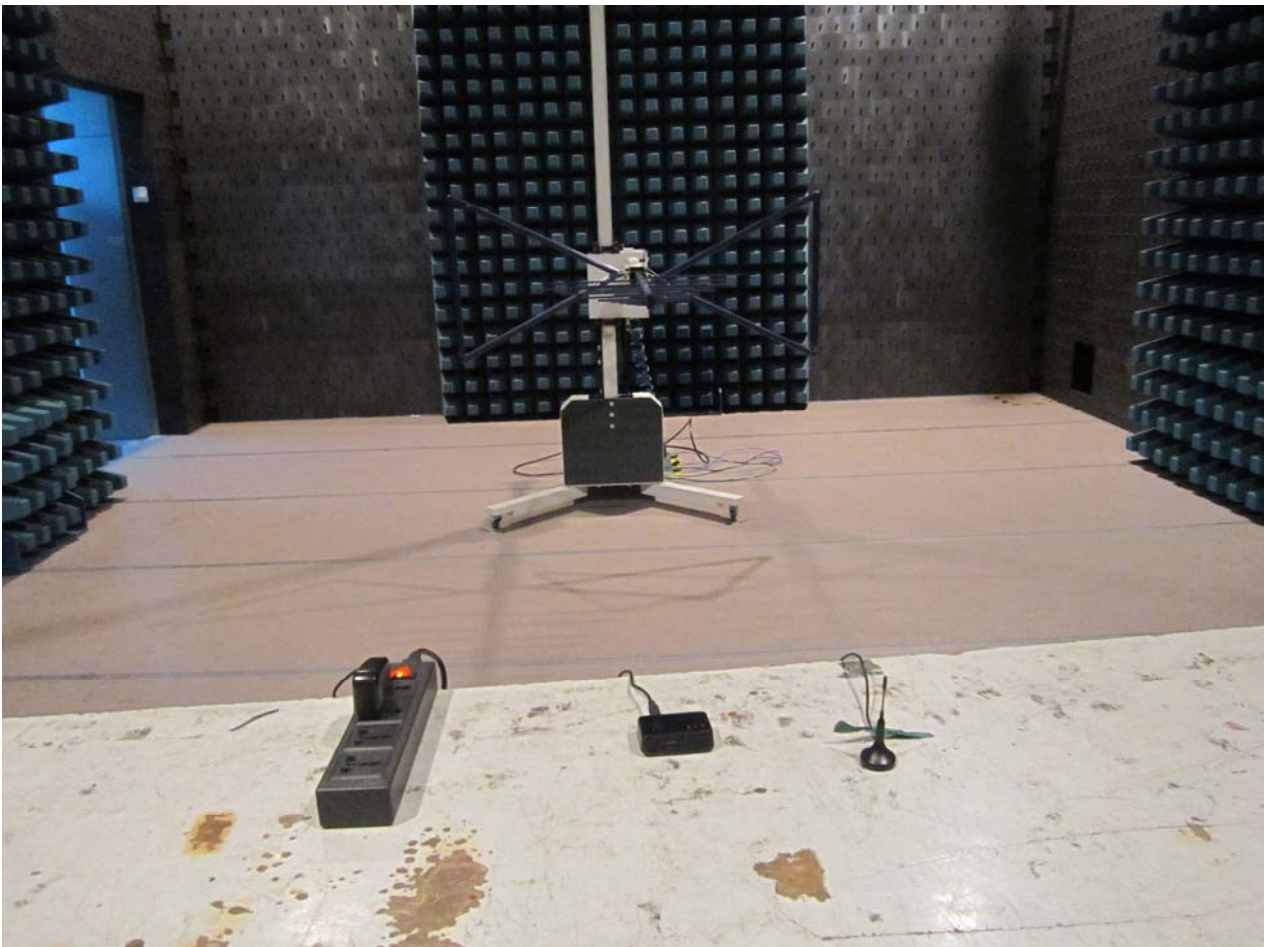
Fig. 2 Radiated emission (30MHz-1000MHz) test configuration