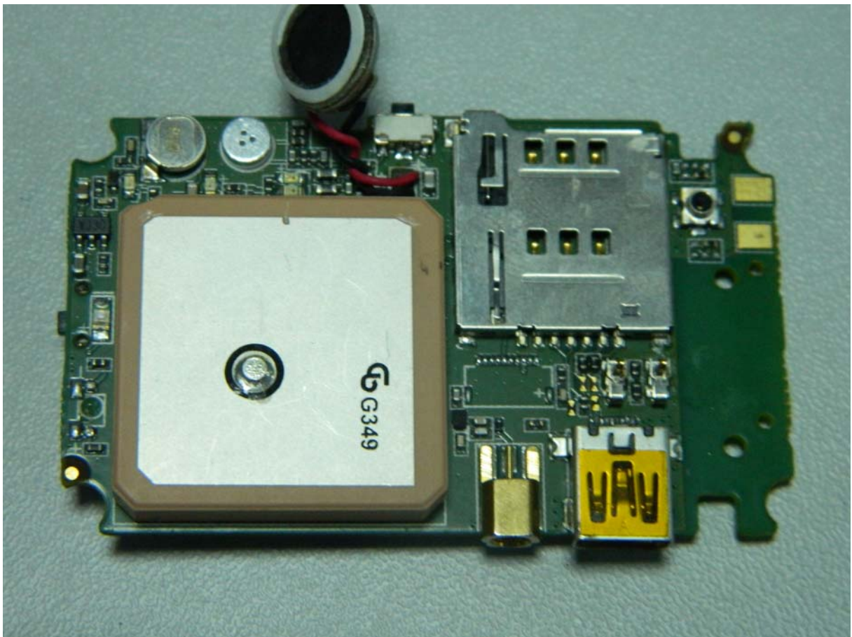
Fig. 2 PCBA (obverse, remove the GSM antenna)