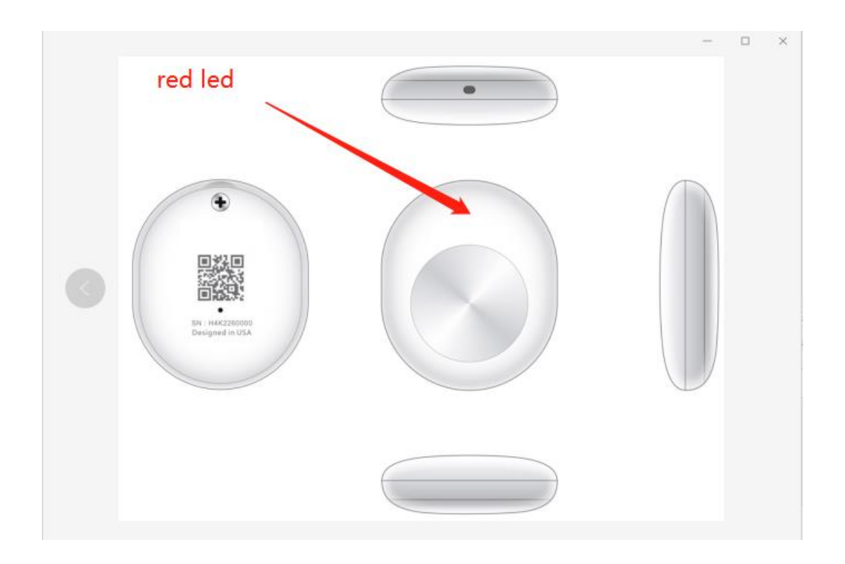
Figure 1-2 There are 1 LED lights in AIRE Mate202 device, the description as following.