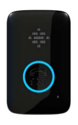
To be added