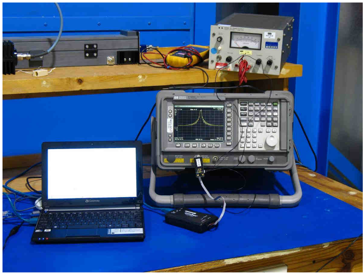
Conducted Emissions at Antenna Port