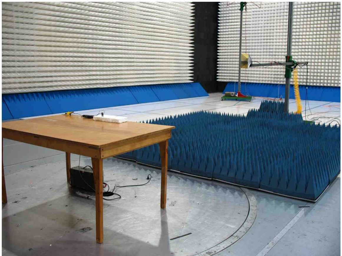
Radiated Emissions (Absorber in place for testing above 1GHz)