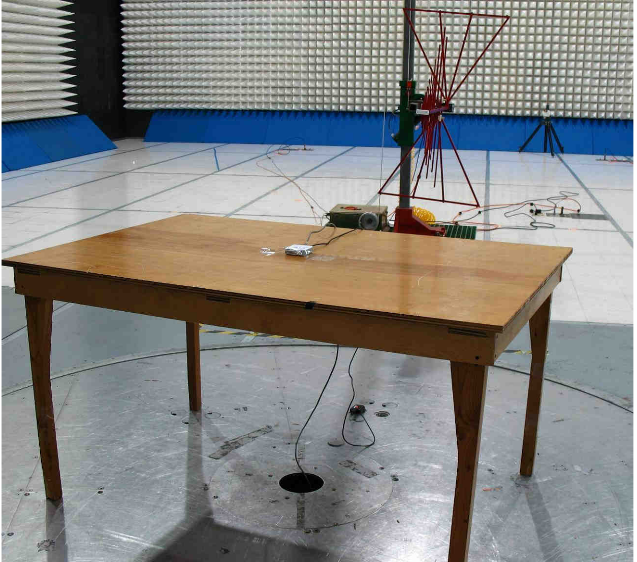
Radiated Emissions Front Side