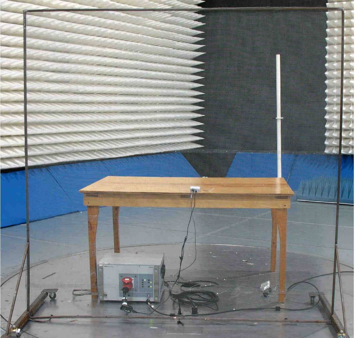
Conducted Emissions Testing