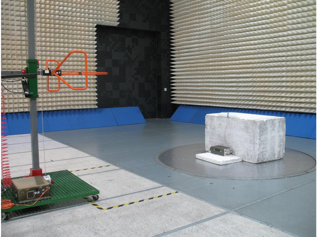
Radiated Emissions Above 30MHz