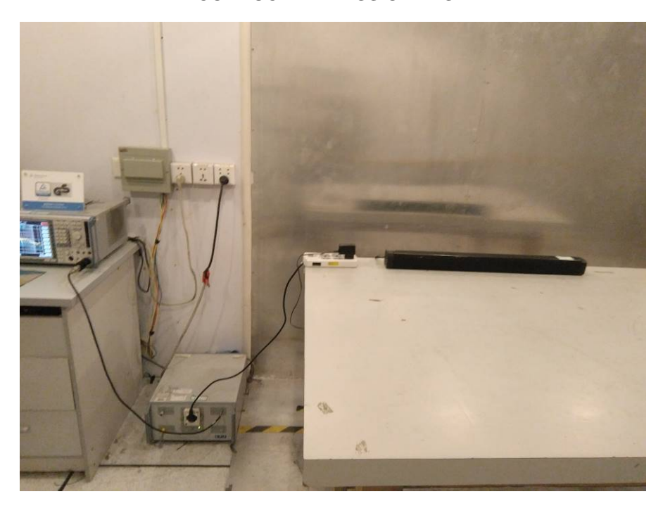
RADIATED EMISSION TEST (Frequency from 30MHz to 1GHz)